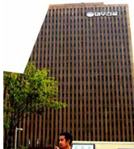
Daewoo International office in seoul, South Korea.

investigation into allegations that Daewoo International is exporting strategic weapons to Burma.