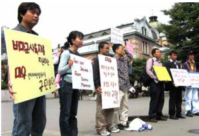
Activists in Korea portested infront of Daewoo office in Seoul on Sep 11 against Daewoo's Arms Export to Burma and demanded Daewoo to expose the truth.

Over 20 Korean civil organizations and trade unions, including Amnesty International South Korea Section and National League for Democracy (NLD) Korea Branch, have issued a joint statement urging the Korean government to conduct a thorough and complete