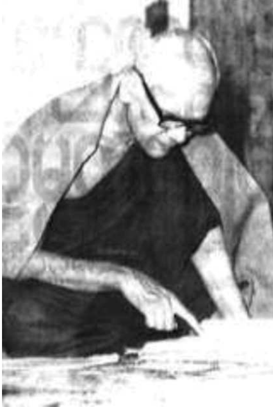
The Venerable Mahasi Sayadaw (U Sobhana Mahathera, 1904-1982)