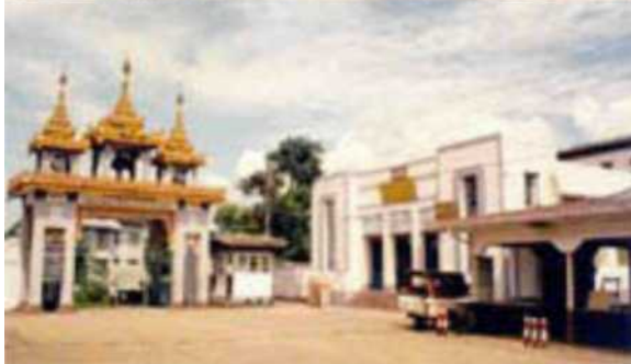
Mahasi Thathana Yeikthar Rangoon (Yangon), Burma (Myanmar)