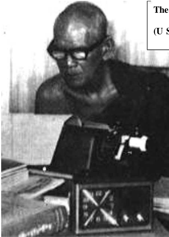
The Venerable Mahasi Sayadaw (U Sobhana Mahathera, 1904-1982)