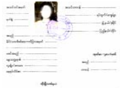
USDA: ID Card