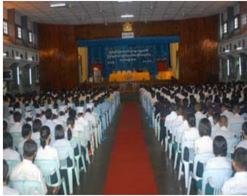
Mass Rally in Karen State, July 2005