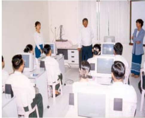
Computer Training Course for USDA Members,