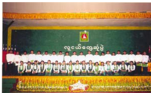
Magwe Division Youth Meeting, May 2005