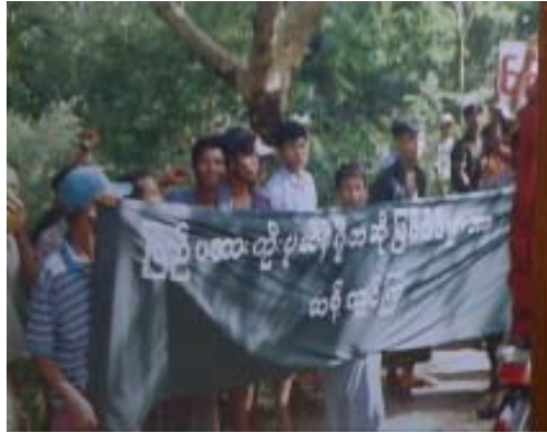
Depayin: Holding Sign Denouncing Opposition, May 2003