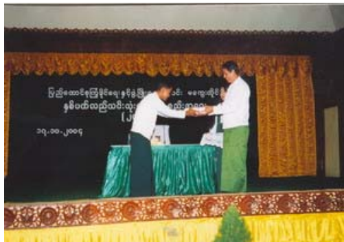
Member Receiving Award at Annual Meeting, October 2004