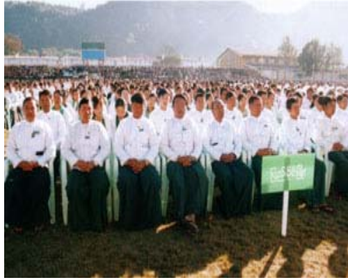
Mass Rally, Shan State