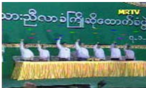
Mass Rally in Support of National Convention in Rangoon, 2005