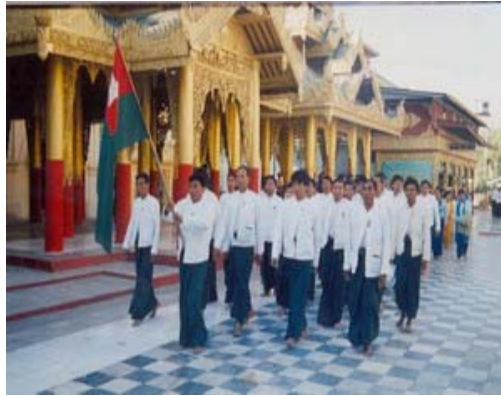
Magwe Members Marching on Union Day, February 2006