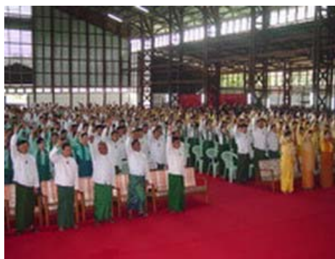
Mass Meeting: Chanting Slogans Against 'Destructionists,' August 2005