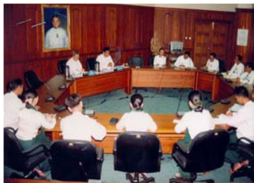
USDA Meeting, July 2005