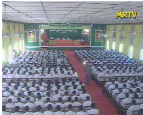
Mass Rally, Rangoon