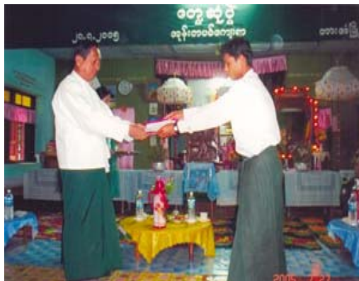
Receiving Application Forms, Karen State