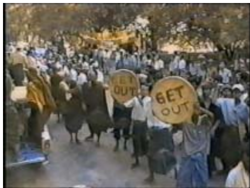
Depayin: Harrassing Opposition, May 2003