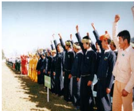
Shan State USDA Members in Ethnic Dress Shouting Slogans