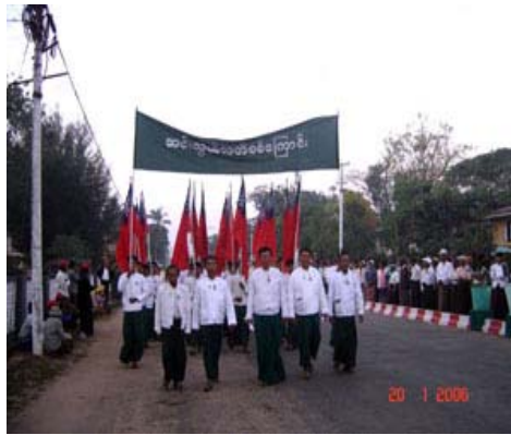
USDA Members Marching to Rally, Shan State