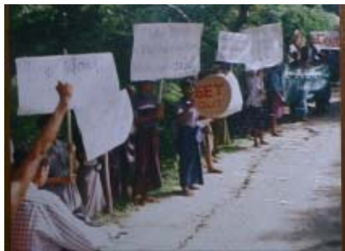
Depayin: Denouncing Opposition, May 2003