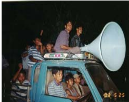
Depayin: Using Loud Speaker to Intimidate Opposition, May 2003