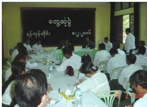
USDA Meeting, Rangoon