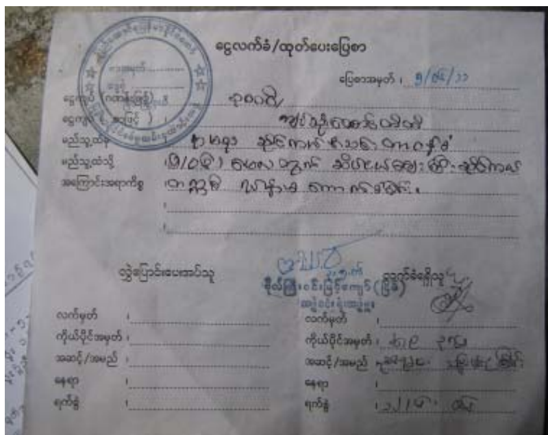
A Motorbike parking fine from Mergue Township, Southern Burma

Whilst border guards, the military and others become wealthy off charging exorbitant illegal taxes, everyday Burmese continue to suffer under a taxation system that is often illegal and changes daily.