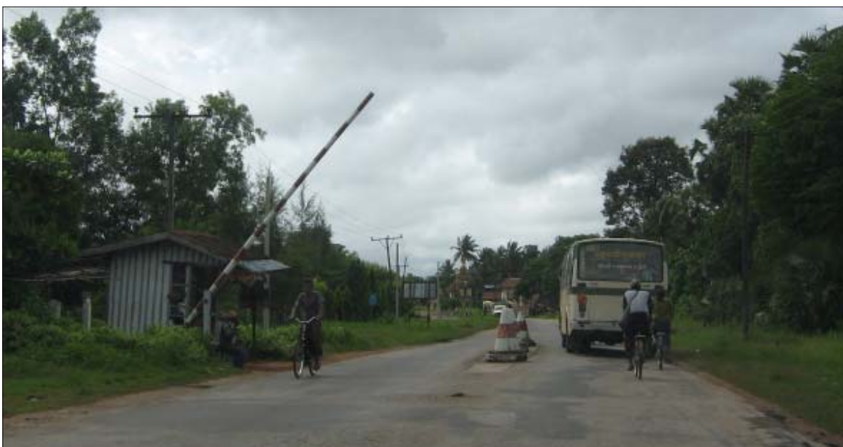
A Government's check point on Moulmein-Ye Highway

The imposition of travel taxes is not limited to cases where civilians are traveling long distances. People who simply wish to travel around their villages and get to their farms or plantations for everyday work are also extorted by the army and local authorities as the case below illustrates.