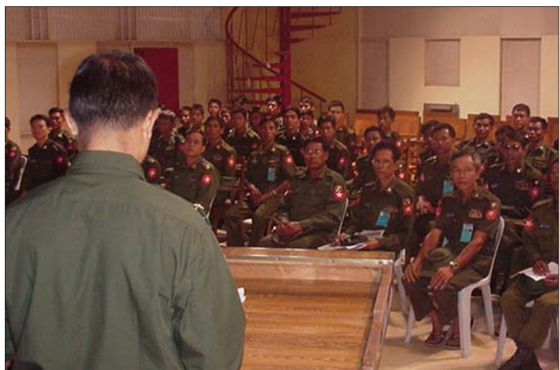
Photo of an emergency security meeting with top-level military officers in the Southeast Command

According to one of HURFOM's field reporters, the Chaung-Zone township authorities and the USDA officer have been recruiting at least 10 people from each ward and village to join the pro-government group. The reporter stated that: "The main responsibility of these people is to