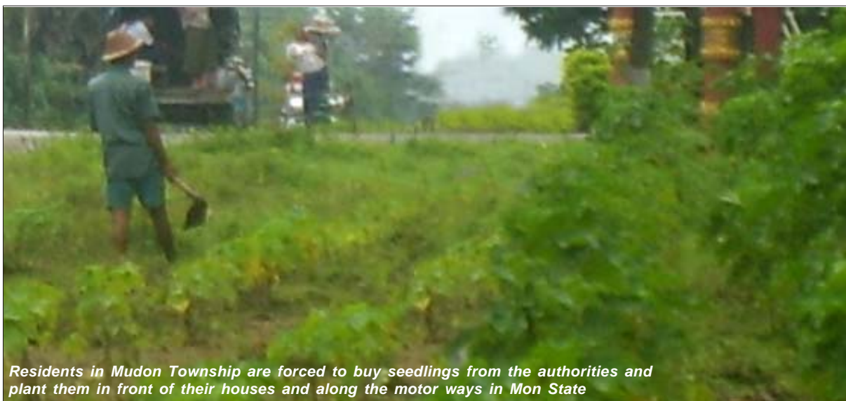
Residents in Mudon Township are forced to buy seedlings from the authorities and plant them in front of their houses and along the motor ways in Mon State

“Before, we bought the castor-oil plant seeds ourselves and planted them. Now, we are forced to buy seedlings from the military and plant them in front of our houses, in our gardens and along our fences. We’ve already lost 7000 Kyat from buying seedlings,” said a Young-Down villager. The villagers are usually forced to grow the castor-oil plants repeatedly because, after being planted, the plants are not cared for and are often eaten by cows and buffalos.