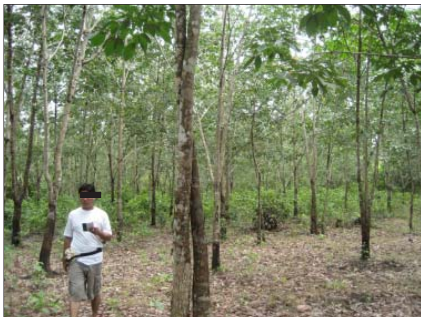
An Army staff from LIB No. 587 and a confiscated rubber plantation in Kun-du village, Ye Township, Mon State