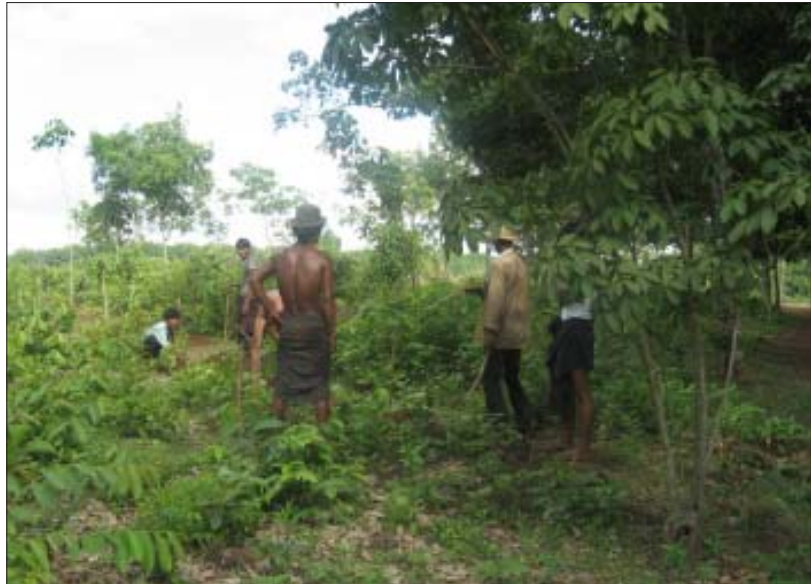
Villagers were forced to work in the LIB No. 587's confiscated rubber plantation near Aru-taung village, Ye Township

Last February 2007, an Ayu-taung villager, 22 year-old girl, got married with Sergeant from LIB No. 587. Including her, there were about 5-6 girls from the villages around these area, got married with Burmese. Some villagers complained that it is very obvious that Burmese were trying to get married with Mon girls according to their policy. Therefore, their Population Transfer Project is one of the reasons why most villagers want to leave village and flee to Thailand.