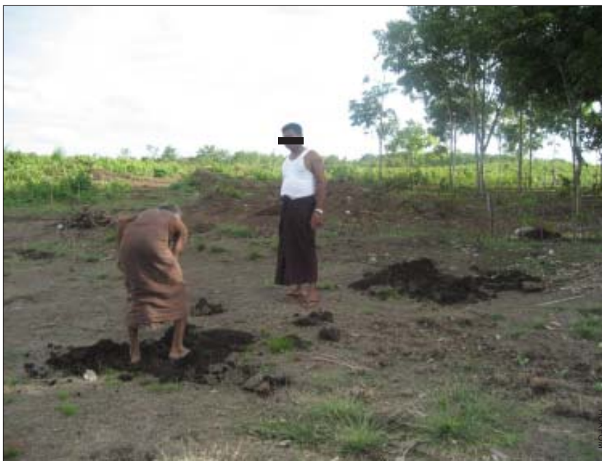
A forced labour victim from Aru-taung village and an Army staff (a Sergenat) from Kun-du based LIB No.587

In early October 2007, villagers from Ayu-Taung village in Ye Township were forced to work on rubber plantations that had been confiscated by the LIB No. 587. The orders were given by LIB No. 587's Captain Myint Zaw. The villagers were forced to work in rotating groups of 30. Another 30 people were chosen after the first group completed its week of work.