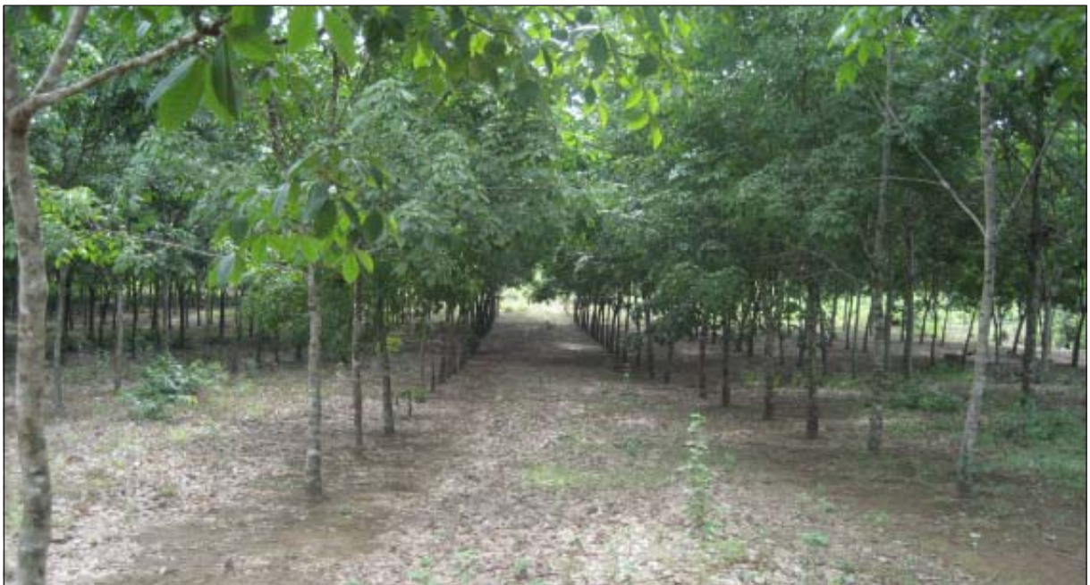
This rubber plantation was confiscated by LIB No. 587 in Kun-du village, Ye Township, Mon State