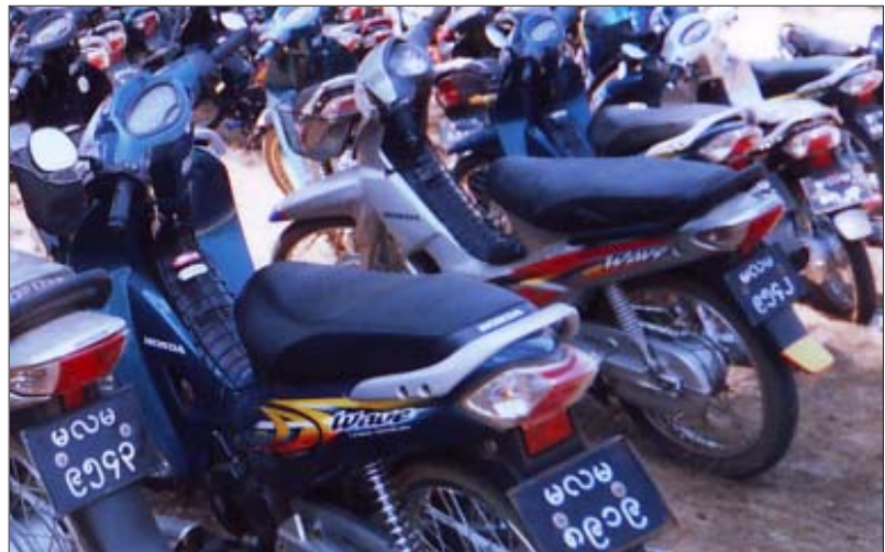
These motorbikes owners have been arrested and made to pay money to avoid detention

The youths were detained in Kamarwet police station for a night on November, 17 and their parents had to pay 20,000 kyat per person and