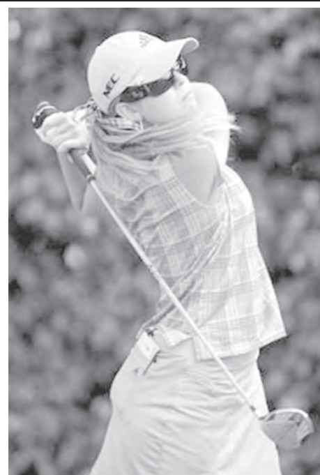
Paula Creamer of the US watches her tee shot on the 6th hole during the final round of the ADT Championship LPGA golf tournament at the Trump International course in West Palm Beach, Florida on 18 Nov, 2007.