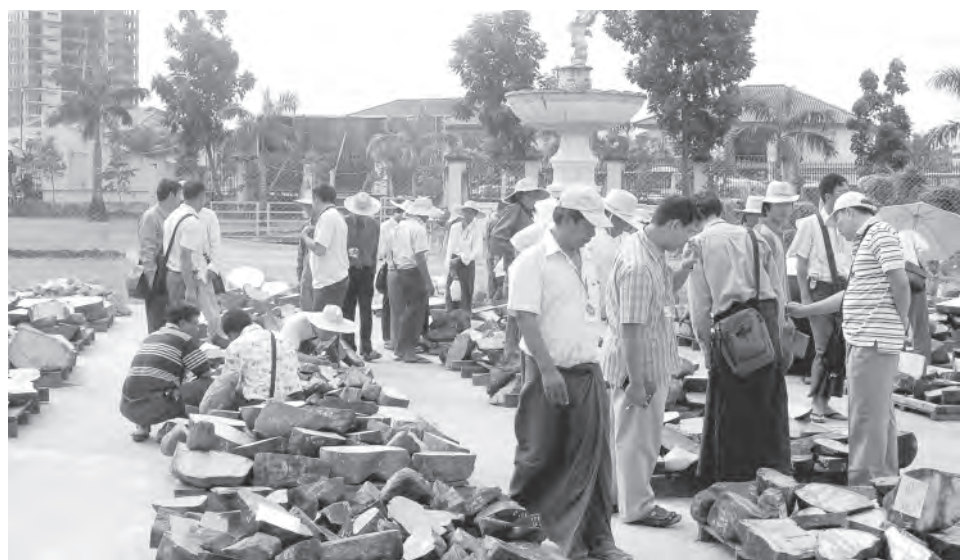
Merchants view jade lots. —MNA

continue up to 23 November. A total of 3,582 merchants—2,261 merchants of 1,583 companies—gathered at today's sales. More merchants are expected to arrive. — MNA