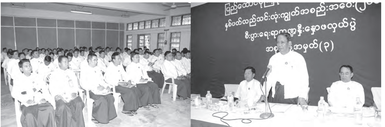
Secretariat Member of USDA U Aung Thaug delivers an address at discussion on economic sector of the Group 3.