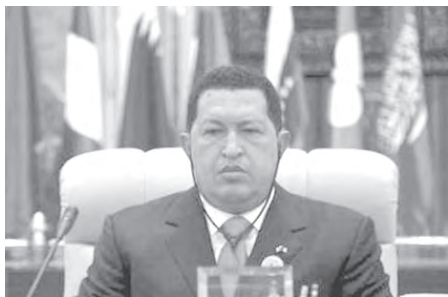
Venezuelan President Hugo Chavez.

Chavez addressed a hall containing Iranian