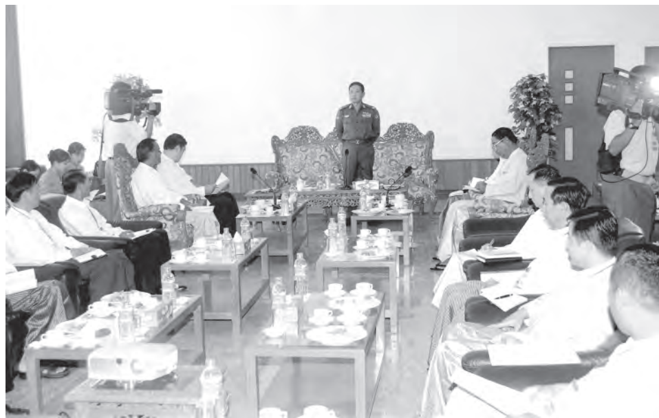
Minister Brig-Gen Ohn Myint delivers an address at work coordination meeting of joint-venture mining companies.— MNA

YANGON, 19 Nov— A work coordination meeting of joint-venture companies engaged in mining of jade and gems together with the government on mutually beneficial basis was held at the Myanmar Convention Centre in Mayangon