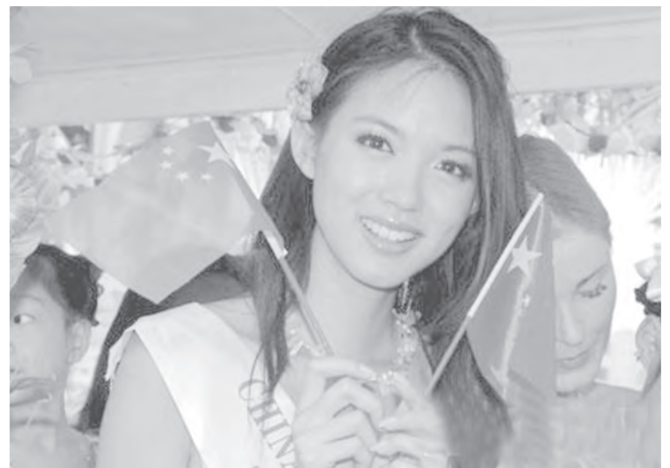
Miss China enjoys the Hainan Carnival in Sanya, south China's Hainan Province, on 17 Nov, 2007. Contestants from 106 countries and regions will compete at the final of the 57th Miss World Competition in Sanya on 11 Dec.