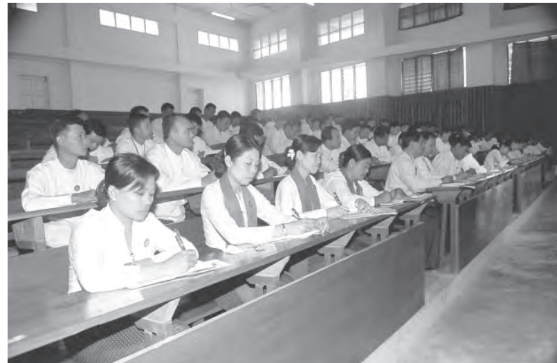
Secretary-General of USDA U Htay Oo delivers an address at group-6's discussion on sector of guarding against the destructive acts.