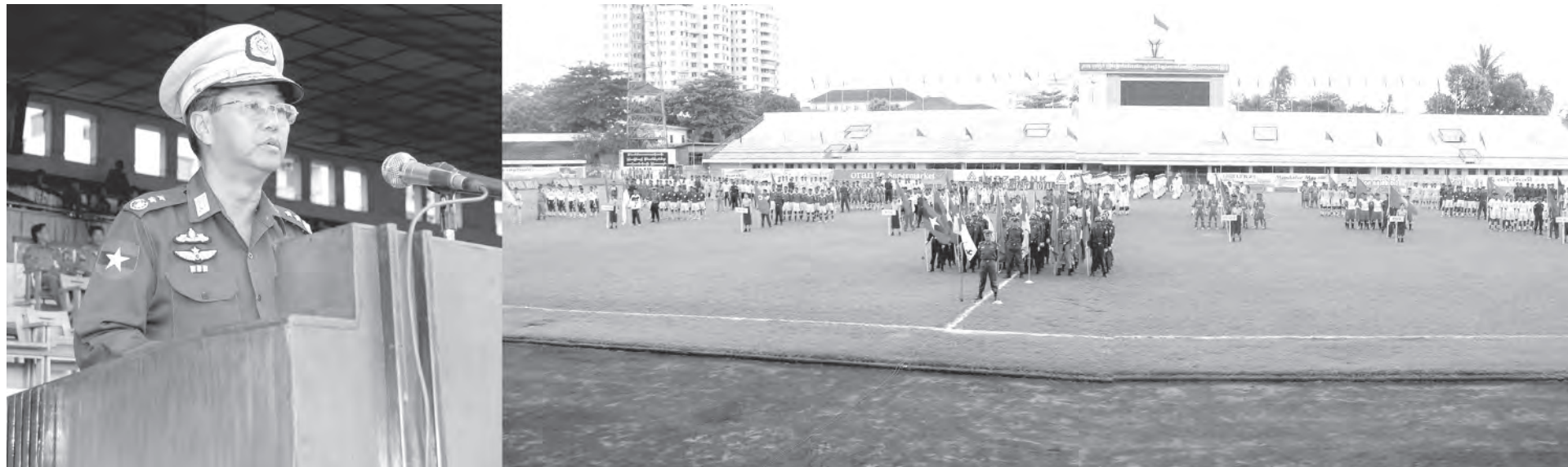
Lt-Gen Myint Swe delivers an address at a ceremony to commence 46th Defence Services C-in-C's Trophy Tatmadaw (Army, Navy and Air) Football Tournament.