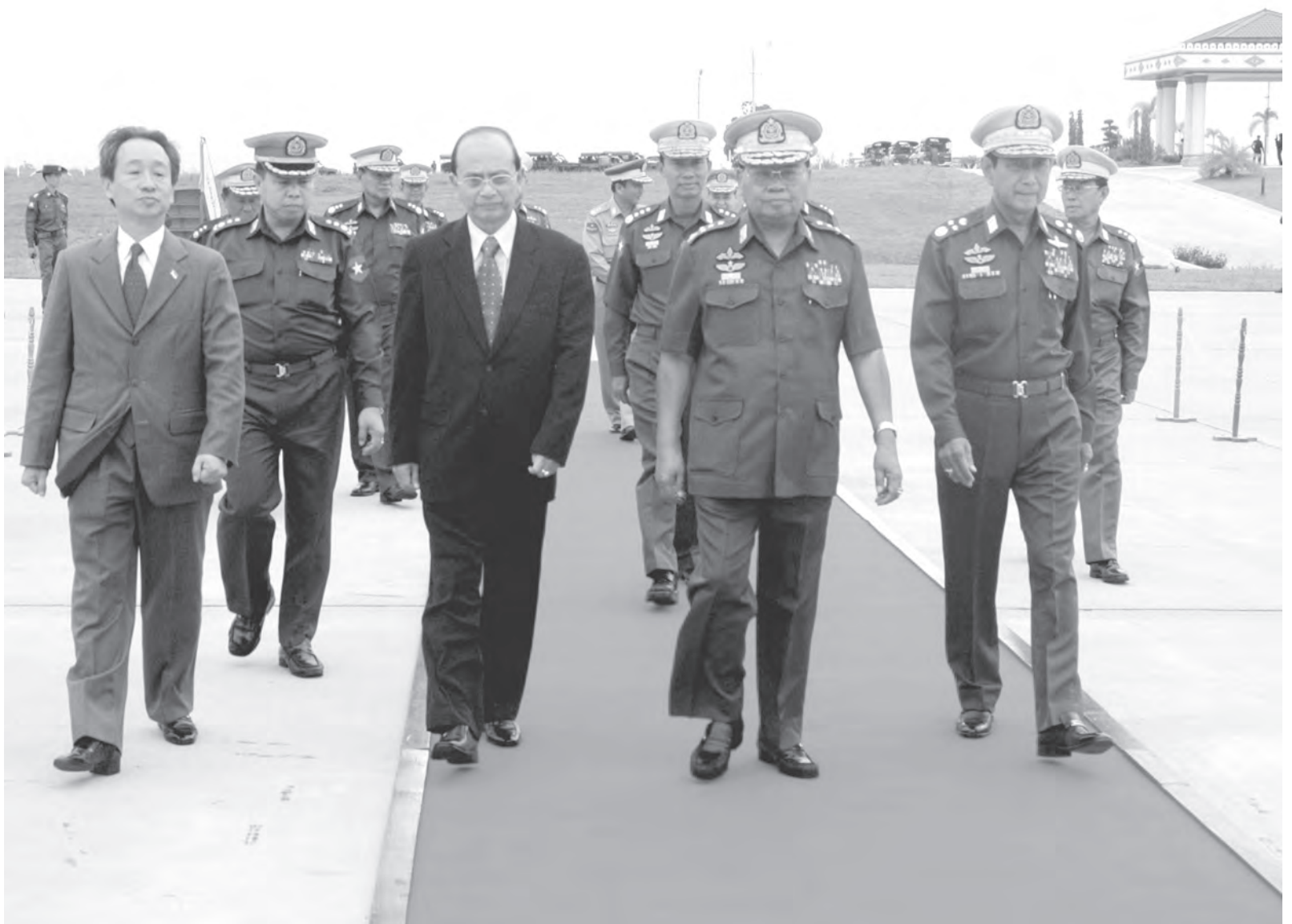
Senior General Than Shwe sees off Prime Minister General Thein Sein at Nay Pyi Taw Airport.