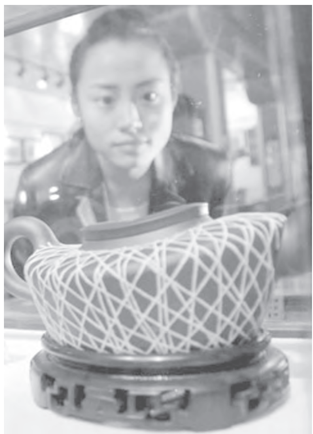
Visitors take a close look at one of the top ten zisha (purple clay) teapots of 2007 in the shape of Chinese National Stadium, dubbed as the Bird’s Nest, shown in Shanghai, east China’s municipality, on 17 Nov, 2007.