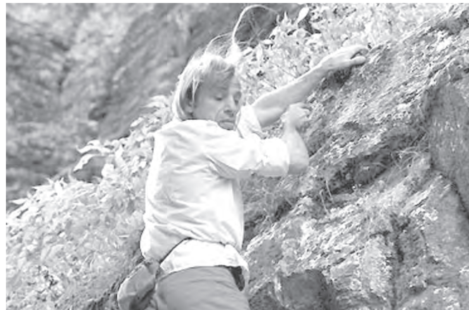
French “Spiderman” Alain Robert climbs Tianmen Mountain in the scenic area of Zhangjiajie, central China’s Hunan Province on 18 Nov, 2007. Alain Robert successfully finished scaling the left side of the steep 200-meter-high cave of Tianmen Mountain with about 1 hour on Sunday.