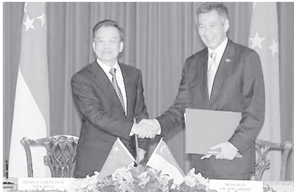
Chinese Premier Wen Jiabao (L) shakes hands with his Singaporean counterpart Lee Hsien Loong after signing the Framework Agreement for the Development of the Sino-Singapore Eco-city Project in Singapore on 18 Nov, 2007.