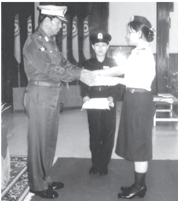
Minister Maj-Gen Hla Tun presents prize to an outstanding trainee.

Therefore, parents, teachers and students are to strive together for creating good conditions such as continuous emergence of human resources, a better education atmosphere and a better environment to pursue education peacefully. Only then, will human resources develop.