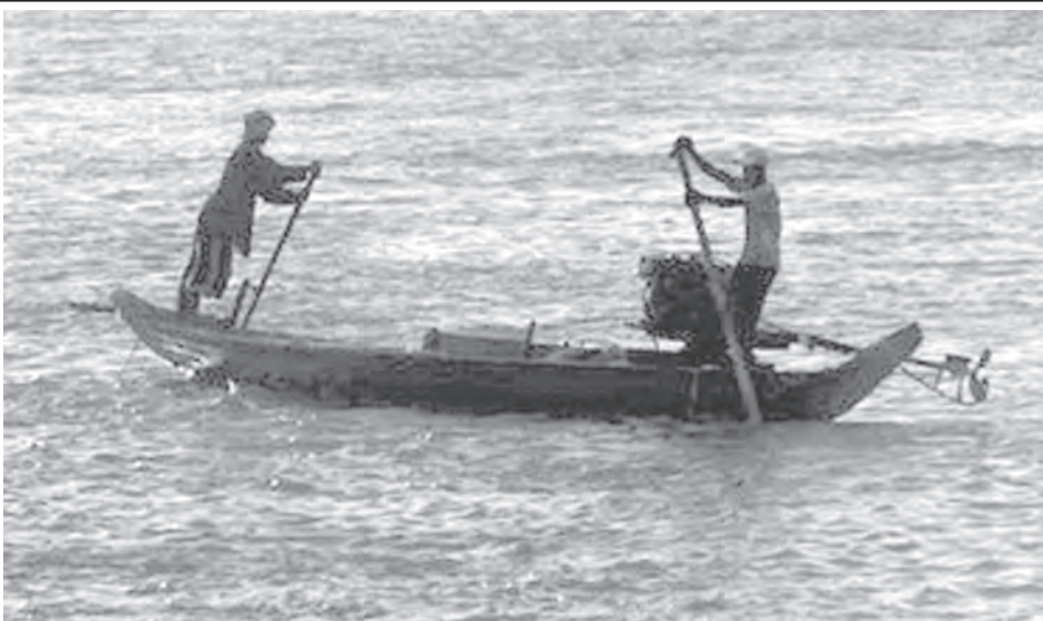
Cambodian fisherman row their boat along the Mekong River near Phnom Penh, Cambodia on 18 Nov, 2007.