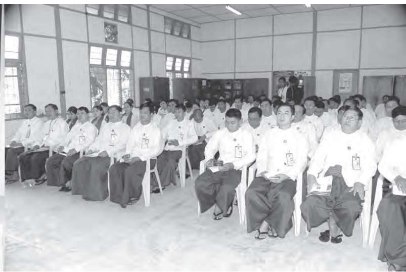
CEC Member of USDA U Aung Min delivers an address at discussion on organizational sector of the group-5.