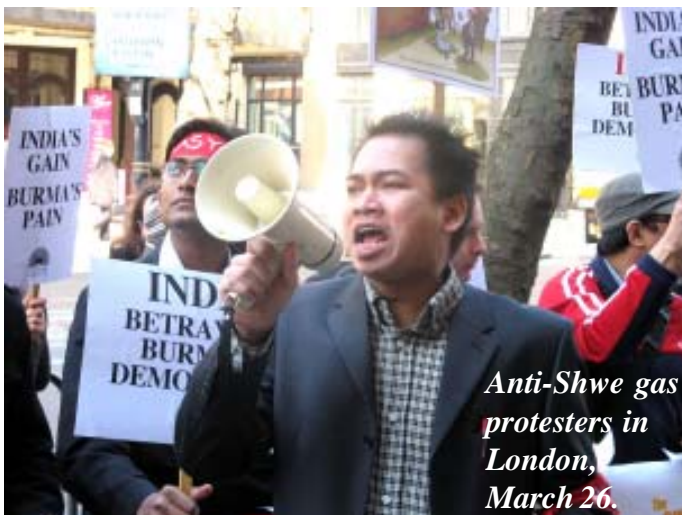
Anti-Shwe gas protesters in London, March 26.