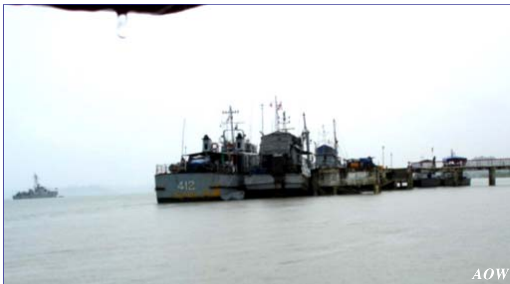
The Burmese Navy's abuses have increased as Daewoo has been drilling offshore oil and gas in Arakan.

Daewoo will be conducting seismic test drilling in its newly signed Arakan offshore block AD-7 from March 8 to April 25, according to the newspaper New Light of Myanmar. The AD-7 block is just 12 km far from the Shwe gas field, in which Daewoo signed onto a 100 percent stake last month.