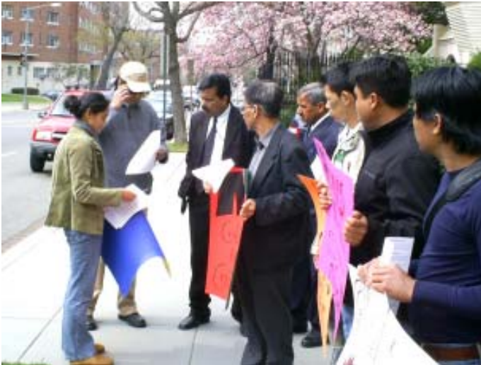
Protesters in Washington D.C, US, talk with Indian officials about the Shwe Gas Project.