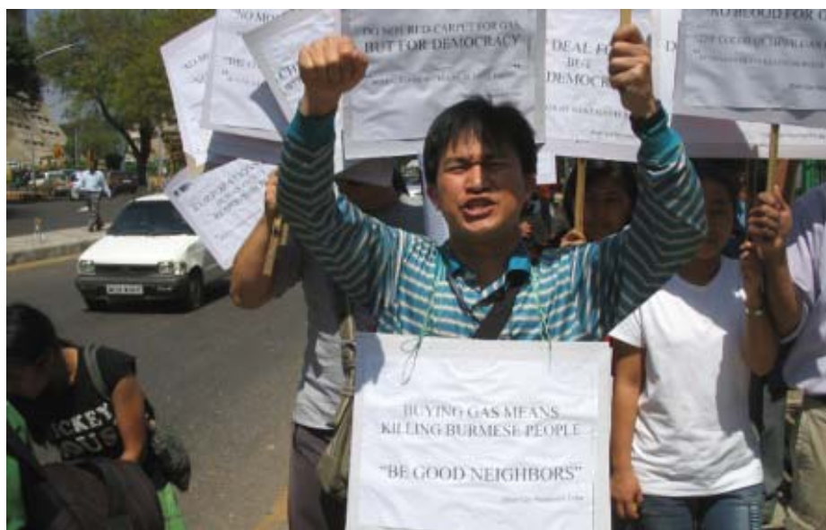
Protesters in India