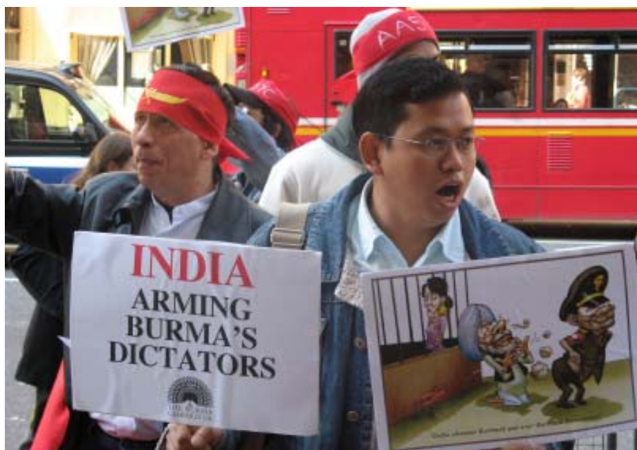
Activists in London protested against the Shwe gas project, Daewoo and India's arms supplies to the Burmese regime in front of the Indian embassy.

Japan, Korea, China, India and Thailand are participating in the bid and the winner will be officially announced in mid or later this year.//