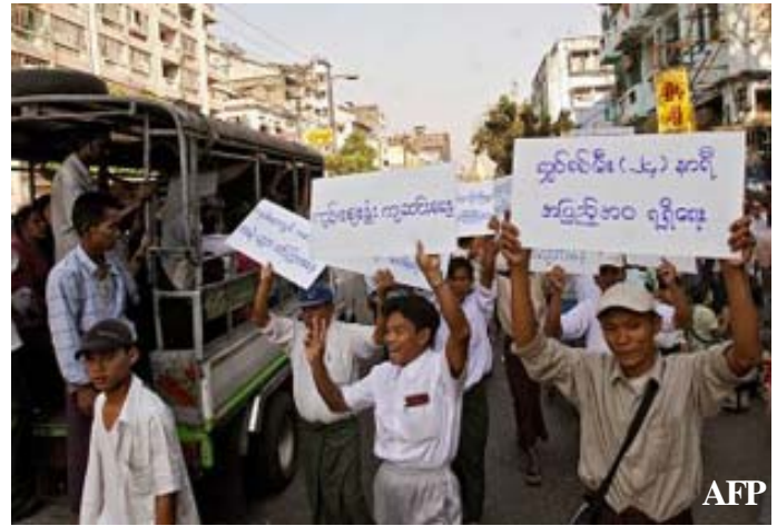
Protestors assembled near a market in central Rangoon, Burma to protest the government's economic and energy policies. Their signs read: "Reduce skyrocketing inflation and access to electricity for 24 hours." Although the Burmese government has built a series of electricity-producing hydropower plants, much of the electricity has been sold to Burma's neighbors, resulting in chronic electricity shortages that have left many Burmese in the dark.

According to statistics released by the Power Division of the Bangladeshi government, the country's current