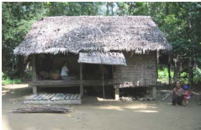
Burma's 52m people are facing deepening poverty.