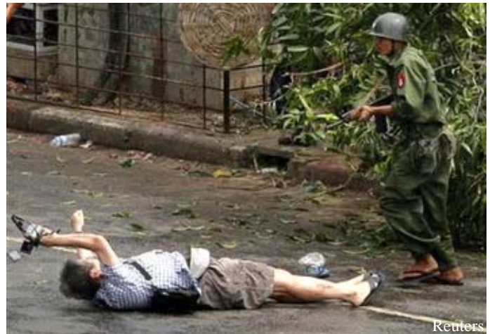
Video journalist Kenji Nagai, 50, a Japanese citizen was killed during the Rangoon protest in Sep 27, 2007.

Founded on 1 November 2006, the ITUC represents 168 million workers in 153 countries and territories and has 305 national affiliates. ■