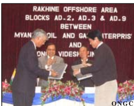
India signs PSC with Burma on Sep 23 for 3 offshore blocks in Arakan State.