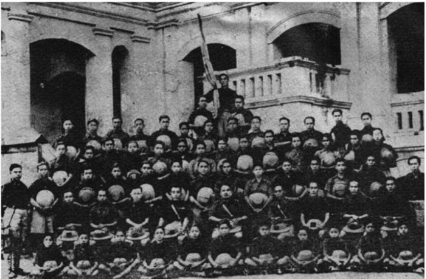
“Mandalay National Central High School Amateur Police Force (Yedat)” 1937