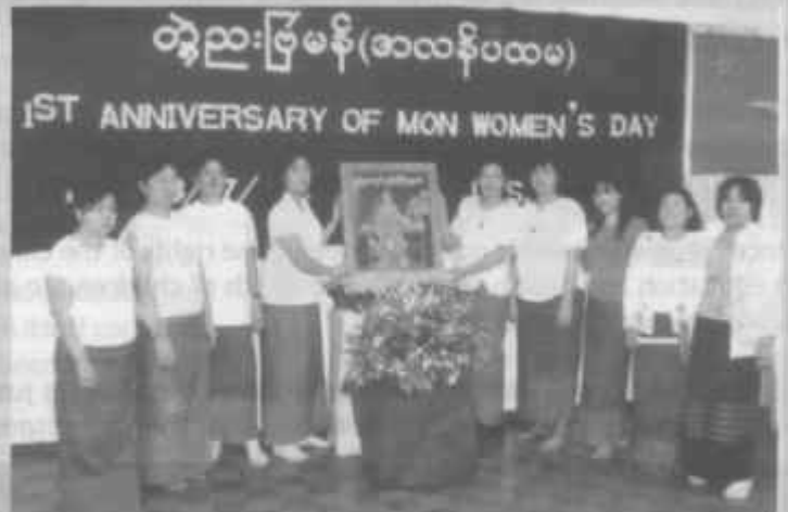
Members of Mon Women's Organization of America

Mon Women and Child Rights Project (Liberated Area) Mon Women's Organization of America Mon Women's Organization (Canada)