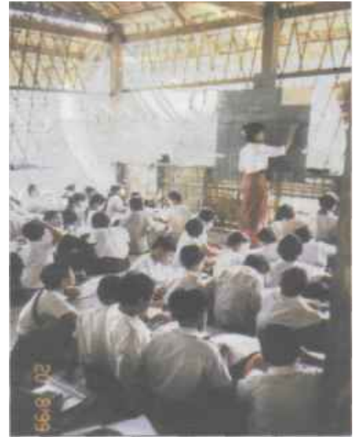
A woman teacher in Mon national school

The MNCWA has planned to eliminate women's illiteracy. However, there is no free education in Burma. CEDAW states that women must have the right to gain an education and to gain experience working in their field of employment. But until today, MNCWA hasn't implemented any kind of plan to help women's education. A few percentage of women in capitals, cities, and towns could get opportunity.