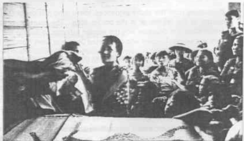
A displaced woman receives clothing from an aid agency

Since 1962, when military's ruling began, the conflagration of civil war was intensified by the successive military of rules, In 1970, "4 cuts campaign " military operation of Ne Win regime made rural people flee to the border areas. + cuts campaign means, the military- regime's Burmese army planned to cut a types of supports: such as food, information, recruitment of guidance; term the civilians to the rebel soldiers.