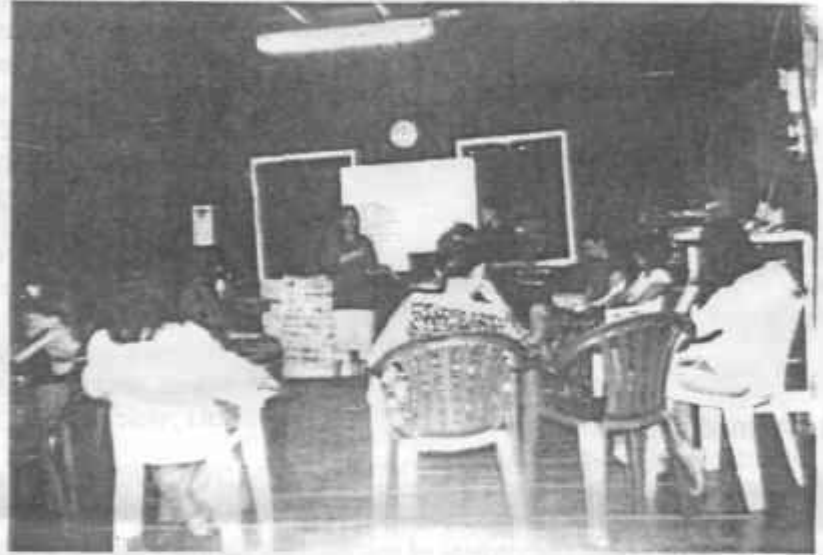
Basic Women rights and Gender issue Training

"In our Mon state, people returned from working in Thailand, Malaysia and Singapore are desperately admired. They put up 3/or/4 million kyat about 3000-4000 US dollar to the prospective brides' parents for marriage. So, parents in our village marry their daughters off. without asking them whether or not they love or like the bride grooms to be. Some men who returned from Thailand, Malaysia and Singapore are likely to be infected with HIV/AIDS. As forcedly made the marriages naturally, are not convenient and there come out domestic violence. There still is not any case in which such problem is help solve by the surrounding people or both side relatives, with or without laws. Regarding this, the attitude of our community is like that we will nor interfere in matters of other families. Traditionally, are we created with an admonishment that women must always respect men and regard her son as a lord and her husband as a god?" said a trainee from Thanbyuzayat township, explaining the situation. It is expected that, through these trainees, the forums on Women Rights and education program must have increased in source areas of Burma and Through the education the problem of sexual harassment of women and domestic violence could be solved.