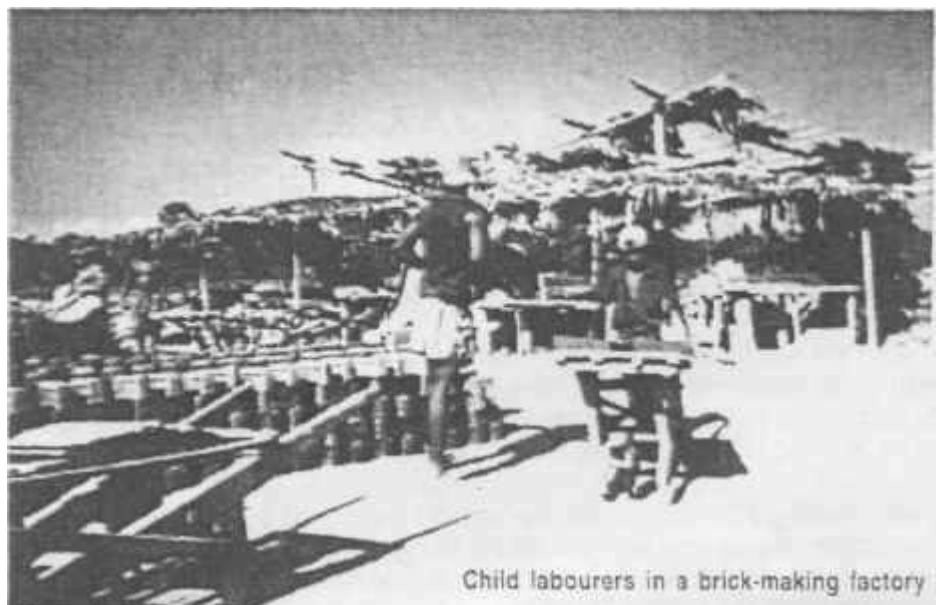
Child labourers in a brick-making factory

As the economic situation gets worse, more and more children in Burma become beggars on the road, at the teashop, at bus stations, at harbors, and at railway stations. Some children join a group of gang, and also beg money at the festival. "It is very difficult to force them out from the market when they beg money," said a stu-