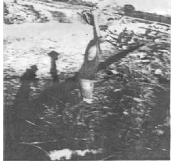
Child labour in a workplace

The number of child labor is increasing. Shop owners hire children because they pay less price than the adult labourer. For example working at teashop salary is 3,000 Kyat (~ 4 US $) per month, and children work from 5 a.m to 10 p.m. For an adult worker, the salary working at teashop is 6, 000 Kyat (- 7 US $ per month. Shop owners who use from child labor not only give enough salary, but also they do not give accommodation for child workers. Some children have to sleep on the road, at the bus station, or railway station or under the bridges in urban areas. Children sell water on railway station, and work at cigarette selling have income is only for 400 and 600 kyat per day.