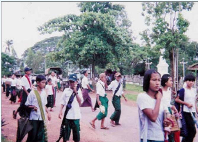
Students in Thanbyuzayat town

"The school entrance fees is 4000 Kyat but The students must pay more for preparing the school," a township resident from southern said. They must to pay not in cash but materials, which needed to prepare the school, such as cements, logs and galvanized iron sheets, he added.