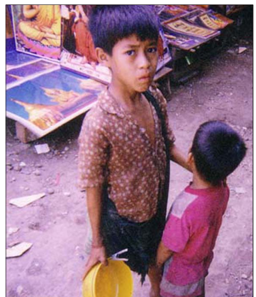
A child Beggar in town

The regime's organization, Maternal and Child Care Association has failed to do assessment and research into why so many children are forced to be beggars and provide has also fouled to with them assistance for schooling and better shelters.