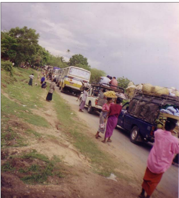
Young Mon women selling foods and snacks in Mon state

More terribly, when the girls went and worked in Thailand, they also feared being arrested by of Thai police and their movement was totally restricted. When the girls were put alone, as they could not speak Thai, they could not communicate with other people. Their situation is completely and isolated.