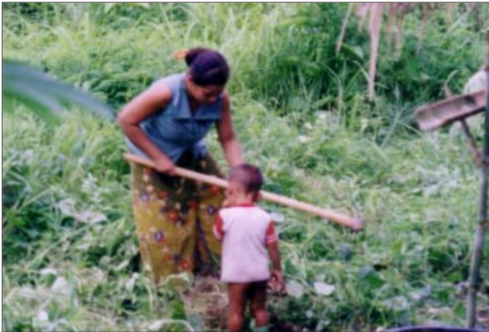
A displaced woman creates a vegetable garden

“To build a house, I have to try cutting wood by myself in the forest. But, to cut the wood, I have to ask permission from the village head. I have no husband and it is a hard work for me”, said 39 years old widow.