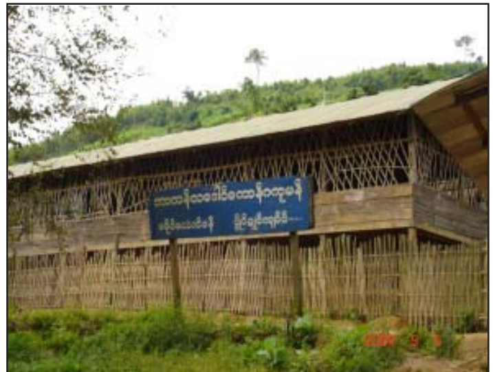
A Mon school in the resettlement site

Many teenage women in IDPs villages get married early and they have pregnancy inappropriate age. Many of them are not aware of health care because they never read leaflet of health care, which is provided from NHEC (National Health Education Committee) and other health education NGO, AMI. Even though NHEC gives knowledge about health education in some areas, they are not able to attend. Many of them have to struggle for their survival in their family.