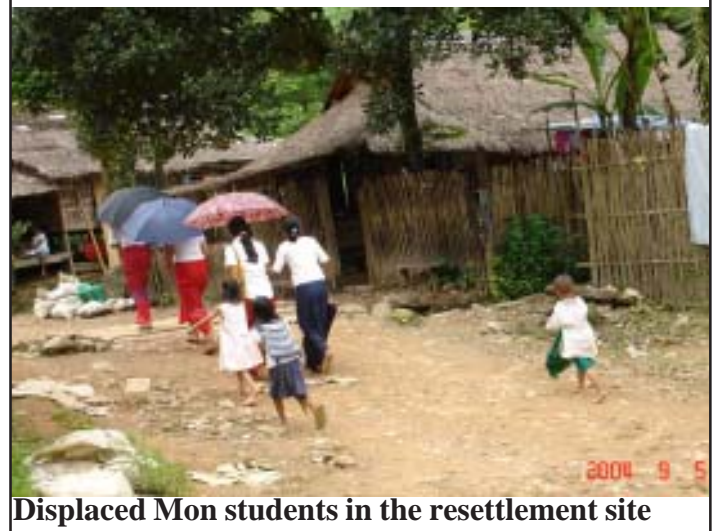
Displaced Mon students in the resettlement site