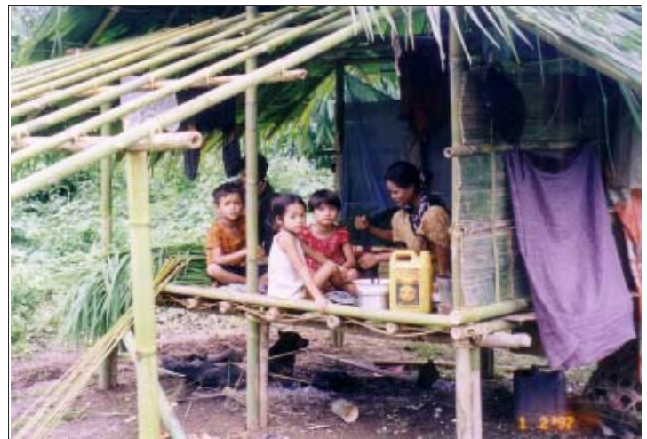
New displaced family

Similarly, there are many IDPs who have faced difficult living conditions in the areas. There are uncounted numbers of IDPs who have starved and have had to eat rice soup, cassava, sweet potato, etc. In the raining season, it is hard for IDPs to go to the forest to find vegetables because the stormy water is flowing on the mountains and the people cannot swim across another side of the river.