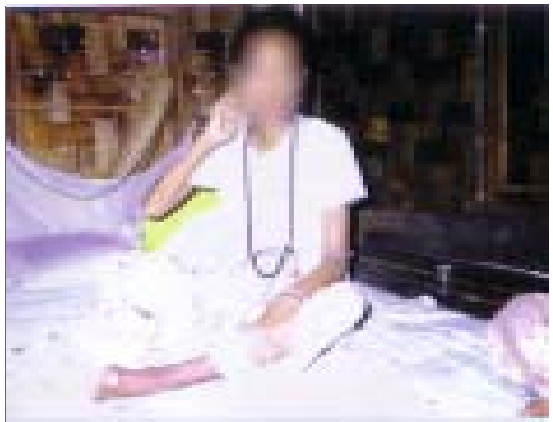
An AIDS patient in a border area's clinic

State parties shall take into account the particular problem faced by rural women and the significant roles which rural women play in the economic survival of their families, including their work in the non-monetized sectors of the economy, and shall take all the appropriate measures to ensure the application of the provisions of the present Convention to Women in rural areas.