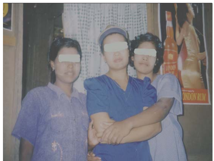
Sex workers in a city of Mon State

State parties shall take all appropriate measures, including legislated, to suppress all from of traffic in women and exploitation of prostitution of Women.