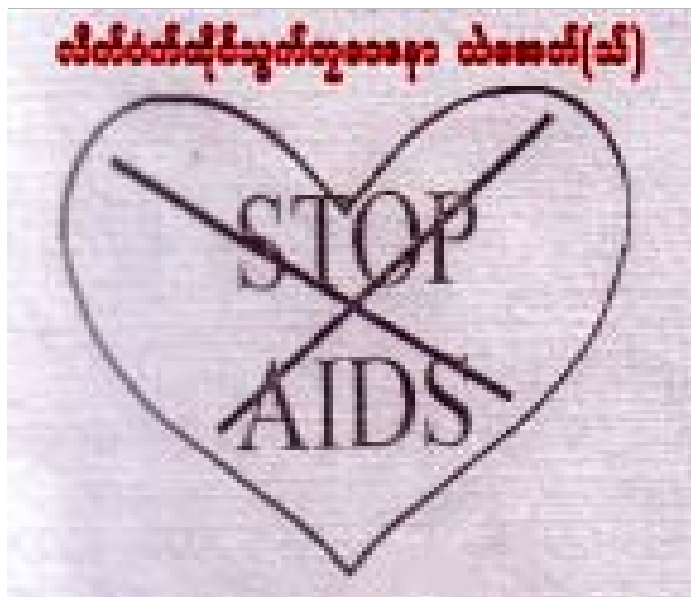
HIV/AIDS Education Signboard in Mon Language in Thailand

One of health care providers from this organization said,