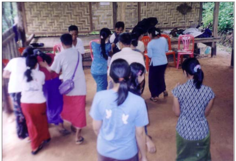
Basic Human Rights and Environment Training

On 1 st day, the trainers introduced the participants about general human rights and the Universal Declaration of Human Rights (UDHR). In order to have the participants understand on the human rights, trainers also used the posters with pictures and explained them for each article. They also explained the article with their situation at their homes, villages and experience in their life. Trainers also asked participants’ experience and their knowledge acquired through hearing in human rights abuses in their community and let them draw some pictures related to the abuses. They also expressed the experience from the abuses with their own drawing pictures.