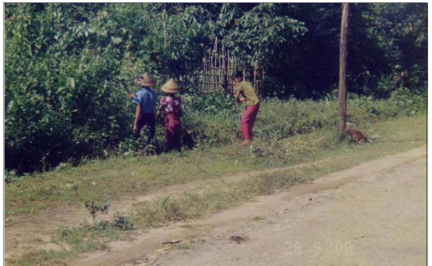
Child forced labor in Ye - Tavoy motor road

This rape case was very common but for women they could speak out what happened to them because of shame and traditions in the communities. Some women also fled from their communities and then fled into Thailand and Malaysia, where they could not face their villagers, who knew their cases longer.