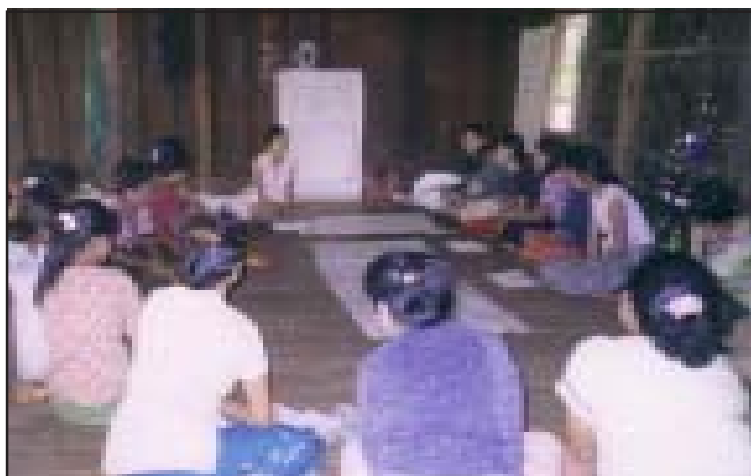
Women Empowerment Workshop

On the 1 st day, workshop started with Introduction and let the participants introduced each other to have warm relationship among them. Without moving to the text of 'human rights', 'women's rights', the trainers let them discuss on the nature of 'power' among the participants. They involved in discussing and try to understand the nature of power in their families, communities and then State levels. They also used some experience related games and activities to well understand what is 'power' and how it created discrimination among human beings.