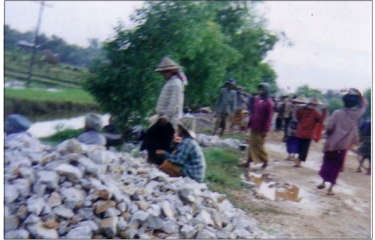
Forced Labour in motor road, in Mon State

One headmen from the area said the soldiers threatened to them that if someone spoke out about the rape case happened in the area, he or she must dig his/ her holes to bury his/her funerals.