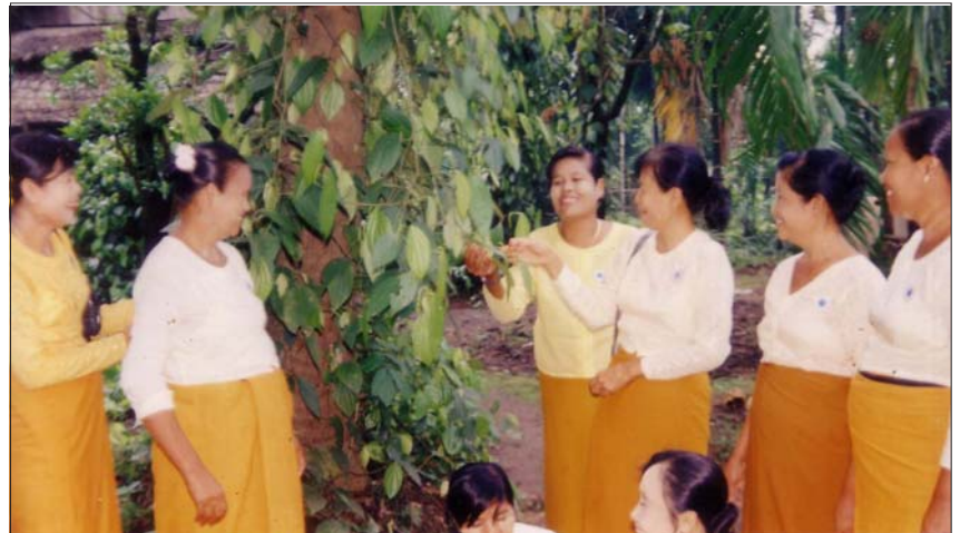
Members of MCWA

But in some villages, women entered to MNCWA as members in order to avoid tax payment to the authorities and free from some abuses committed by authorities and soldiers. The associations themselves never explained about the rights of women especially on the discrimination and sexual violence against women, as they could not protect them practically.