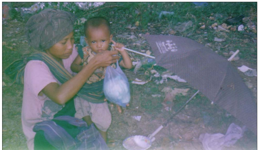
A female begger and her child

She said that many families in Moulmein especially in Myay-ni-gone city quarter have become beggars due to the fact there are no jobs to work to earn money. Numbers of poor families have been gradually becoming beggars in Mon State's capital.