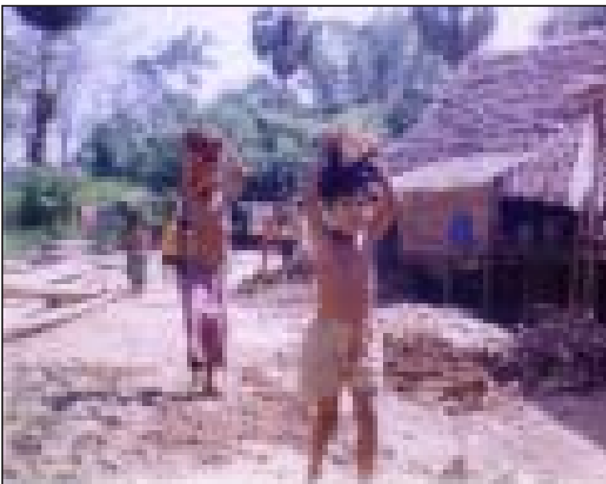
Child Labour in a Road Construction

Because of the economic crisis in the country, parents do not have sufficient time to take care of the children. For the survival of the whole family unit, everybody in the family has to work. The income per person is between 500 and 700 kyat (0.5-0.7 US$), it is only a price for rice per day. The living standard in urban areas is more developed than in rural areas. More children in addition to working to support their families and children like adults, are often pressed into service to carry out forced labor for the military - Burmese Army.