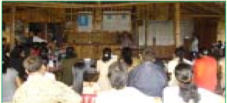
International Day for the Elimination of Violence Against Women Ceremony in Sangkhlaburi

Men participants putted small cards of White Ribbon in their close while attending the ceremony. In this area the ceremony is one of the biggest multi-ethnic national women and men from many organization participated.