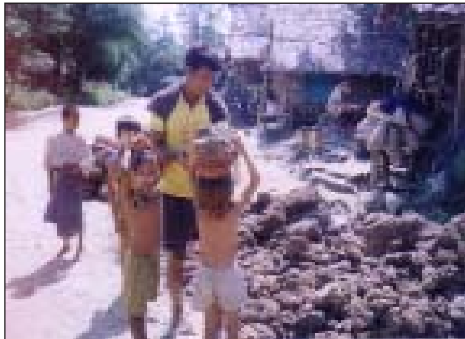
Children are working with the parents