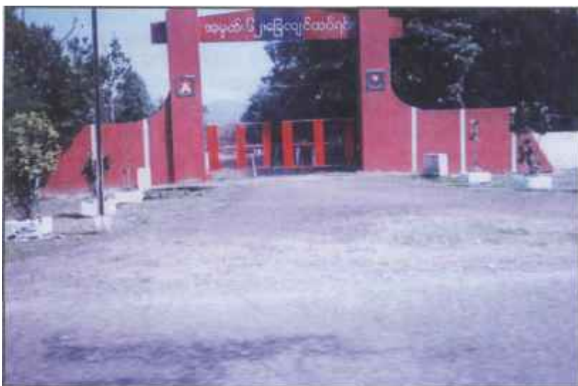
Infantry Battalion No.(62) in Mon State

Domestic violence is a worldly issue. However, the accurate information about this sphere of violence is very difficult to be available. Also is very difficult to discuss or debate this issue. Summed up the experiences of many women, it includes violence against elderly people, taking sex from kinswomen (including girl-children, teenager-girls) through violence, having sex with one's own wife against her desire, and elder brothers' violent treatments upon their younger or elder sisters. Strifes and disagreeability among