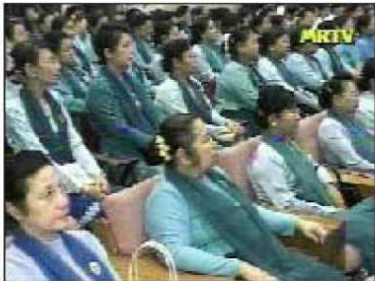
Members of Myanmar National Committee for Women's Affairs

It tantamount that traditional Burmese culture repulses making interference into a family from outside.