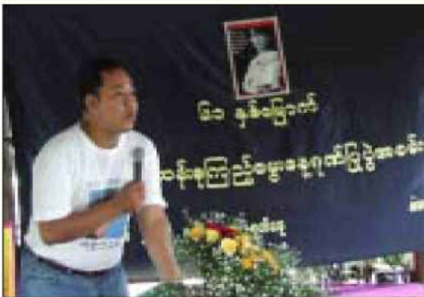
Burma democracy leader Daw Aung San Suu Kyi's 61st birthday celebration