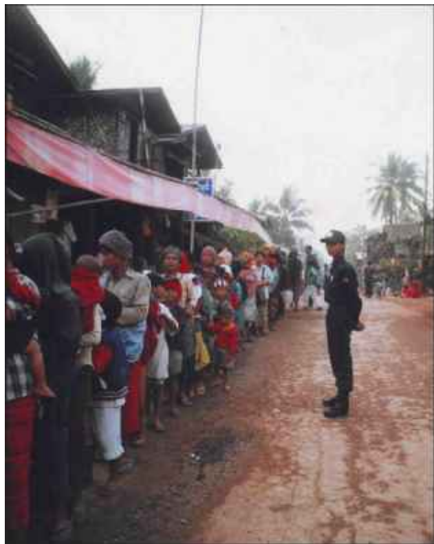
Many Female Beggars and their children in offering festival

In Burmese society, women in the main have to do only such housework as child caring, washing, cooking etc. It is observed that women are not educated, unable to seek earning, while their husbands only have to make money. It leads their incomes to be insufficient to meet household spending and consequently be an ignition of domestic problem. Despite the fact that the educated women, under