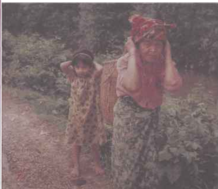
An elderly woman and a girl in a hardship life of gathering forest products

ACTIVITIES: International Women's Day Ceremony Completed