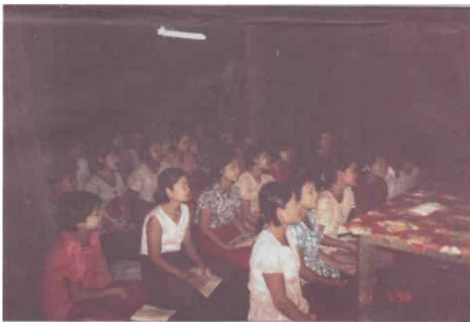
Displaced women in a literacy training