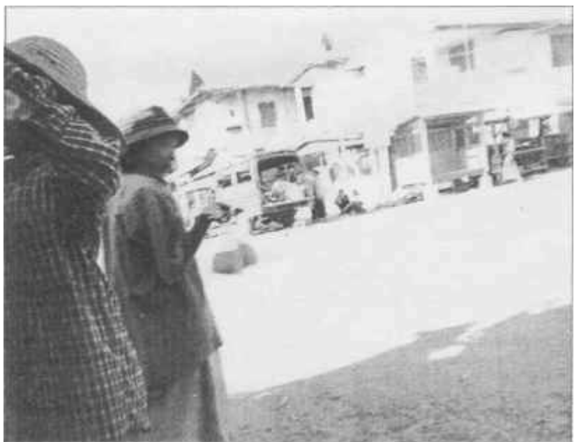
Urban women are selling sugar cane juice at the bus station under hottest sun-heat

Although some works in factories, selling water and foods, restaurants and constructions are hard, but the women, who want to support their families have worked there. Since the SPDC does not care on the labour standard, or the labour laws are just on the papers, many women had to work over 8 hours a day used by their employers.