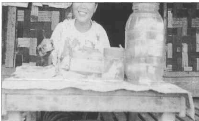
A rural area based woman is selling the betel nut

In rural area, Karen State, Mon State and Tenasserim Division, many women especially work at homes and farms outside of their village and Sub-Town communities. They almost engage in works such as weaving, sewing and making dresses, day-laboures in rubber plantations, farmlands and fruit plantations. They can earn a very low income for some families their income if compared with the needs of their daily expenses for foods and other commodities at homes. They can not afford to feed their families with sufficient food. Mostly their income is in average of 3,000 Kyat but they have to expend more money than they earn.