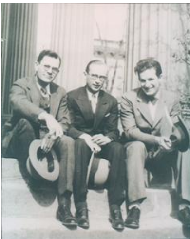
Old Playmakers Theatre steps (UNC-Chapel Hill)