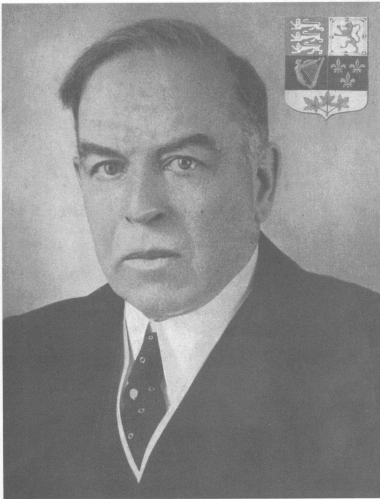
RT. HON. WILLIAM LYON MACKENZIE KING, P.C., C.M.G.

Premier of Canada in 1921; again from 1926 to 1930 and from 1935. After the dissolution of January, 1940, his party was returned with a large majority and he continued in the premiership. He expressed Canada's resolve to stand with Britain in defence of right.