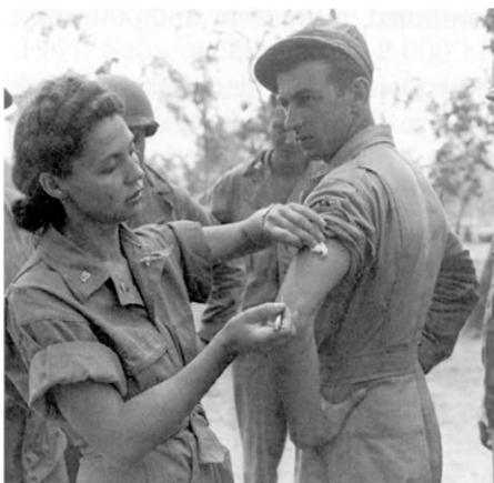
U.S. Army nurse instructs Army medics on the proper method of giving an injection, Queensland, Australia, 1942.

interested in that specialty. More than 2,000 nurses trained in a six-month course designed to teach them how to administer inhalation anesthesia, blood and blood derivatives, and oxygen therapy as well as how to recognize, prevent, and treat shock.