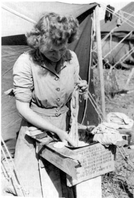
Army nurse does personal washing in her steel helmet, Oujda, Morocco.

as an airfield under construction, making it a lucrative target. The nurses resumed sewing until they had made a large white square, in the center of which medical corpsmen painted a red cross, the proper identification. Episodes like these encouraged the Army to establish a training program for newly recruited nurses in 1943.