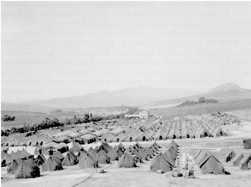
View of a general hospital near Constantine, Algeria, 1943.

sniper fire. Doctors operated under flashlights held by nurses and enlisted men. There were not enough beds for all the casualties, and wounded soldiers lay on a concrete floor in pools of blood. Nurses dispensed what comfort they could, although the only sedatives available were the ones that they had carried with them during the landing because enemy air attacks on the harbor at Arzew delayed the unloading of supplies for two days.