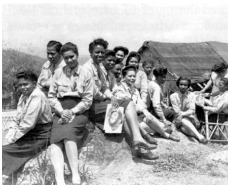
Staff of the Tagap Hospital, Burma, 1945.

Although the Army attempted to employ DDT to control the spread of the disease, it had minimal success. Troops also suffered from exhaustion, malnutrition, and amoebic dysentery. Plane crashes and truck accidents occurred frequently across this difficult terrain.