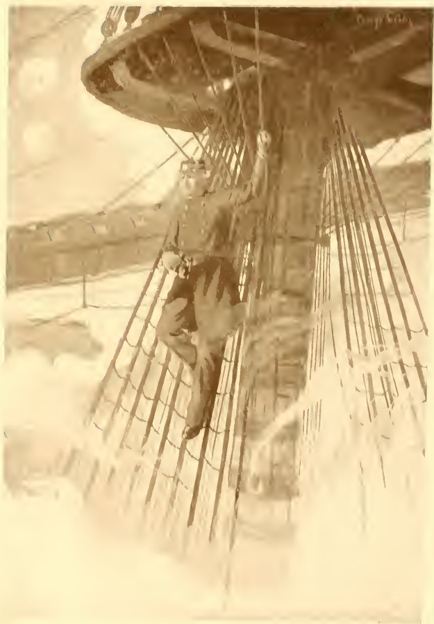
THE ADMIRAL LASHED TO THE RIGGING.