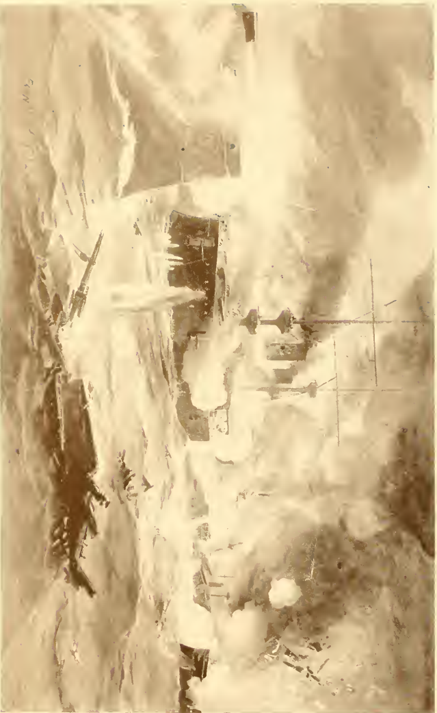
THE ANNIHILATION OF THE SPANISH FLEET IN THE HARBOR OF MANILA