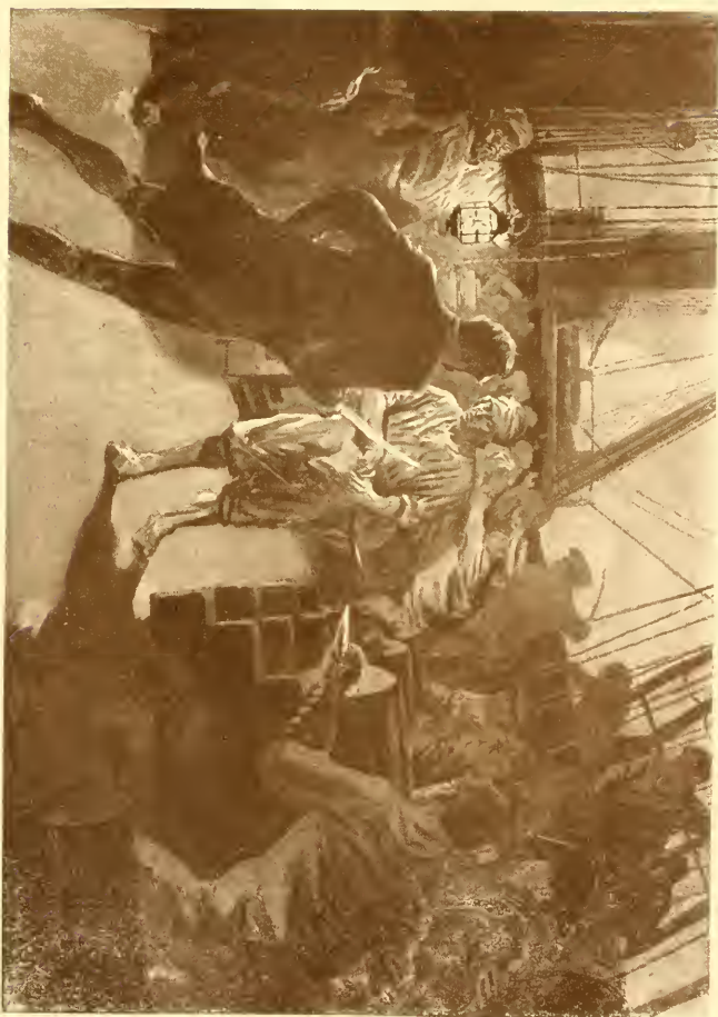
DECATTER BOARDS THE "PHILADELPHIA"