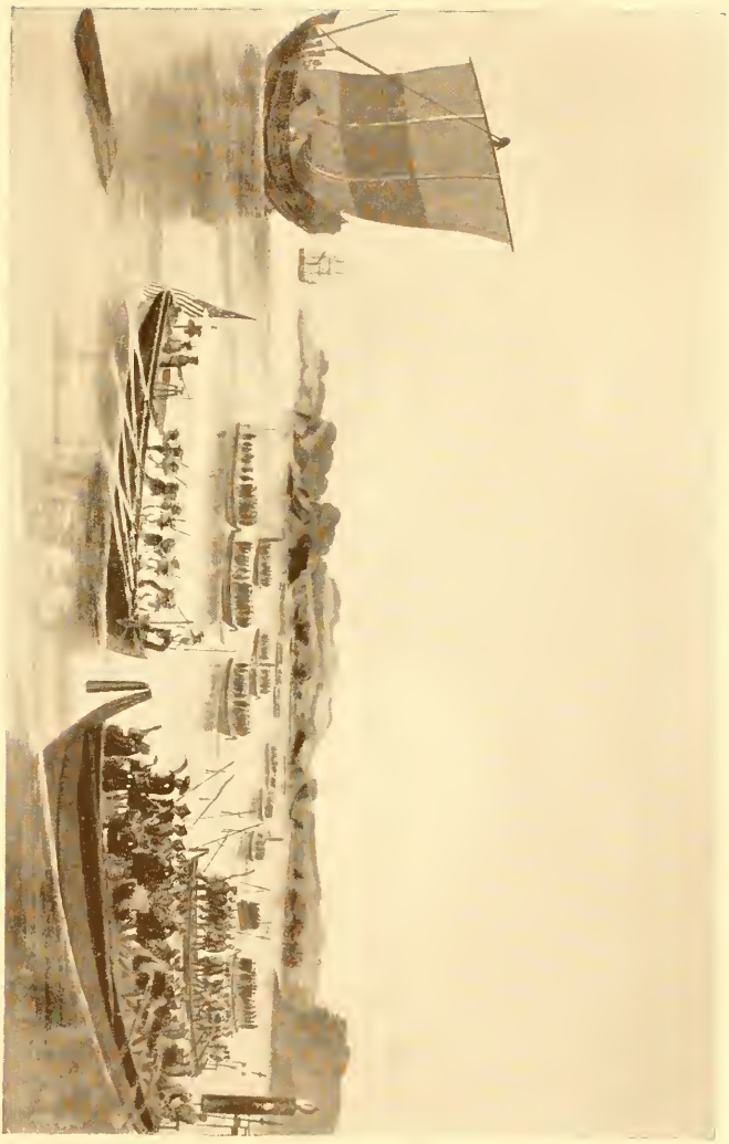
THE MISSISSIPPI'S CUTTER IN THE BAY OF YEDO