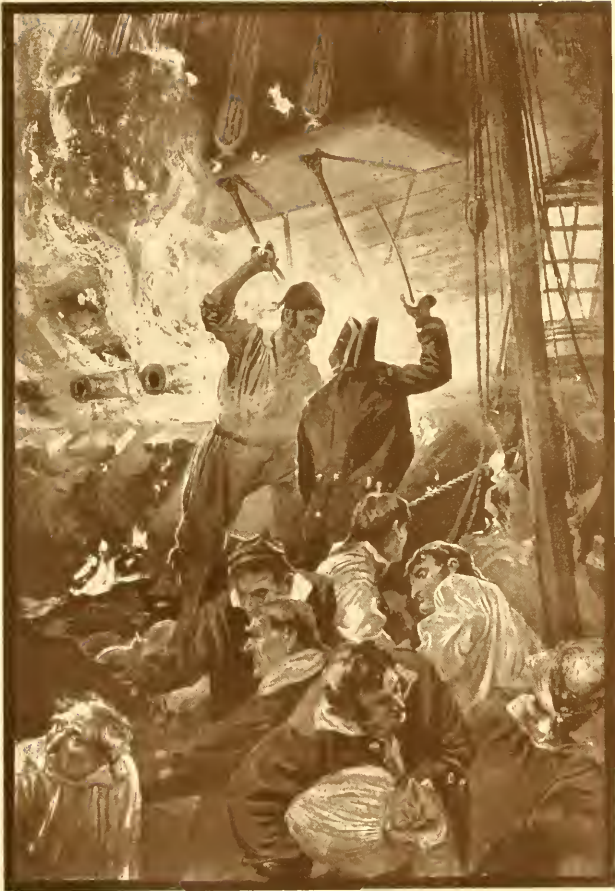
THE DANGER OF THE "INTREPID"