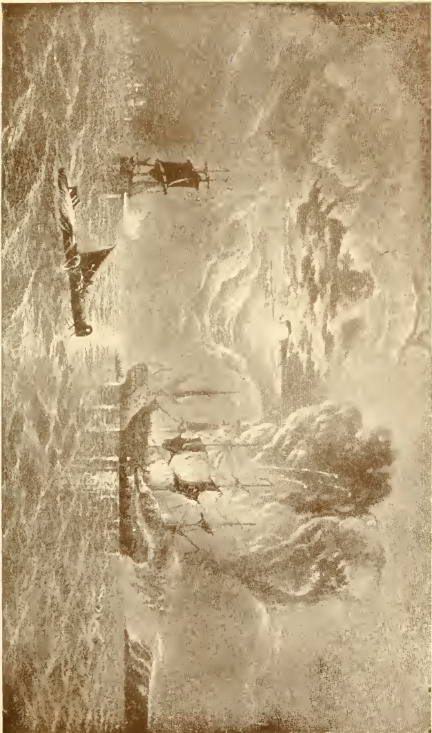
NAVAL BATTLE BETWEEN THE BONHOMME RICHARD AND THE SERAPIS—1779.