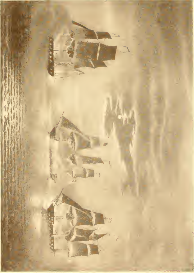
CAPTURE OF THE CYANE AND LEVANT BY THE CONSTITUTION