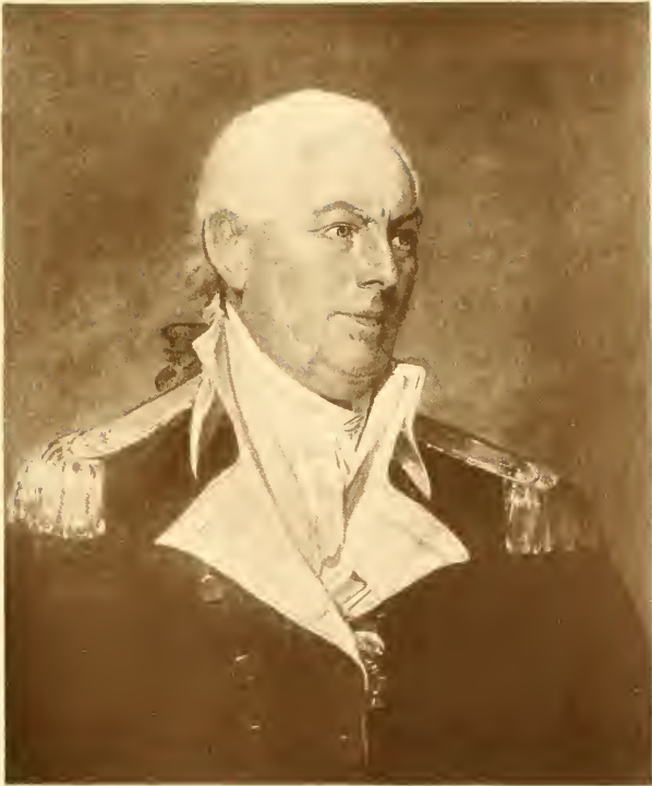
COMMODORE JOHN BARRY From the painting by Gilbert Stuart