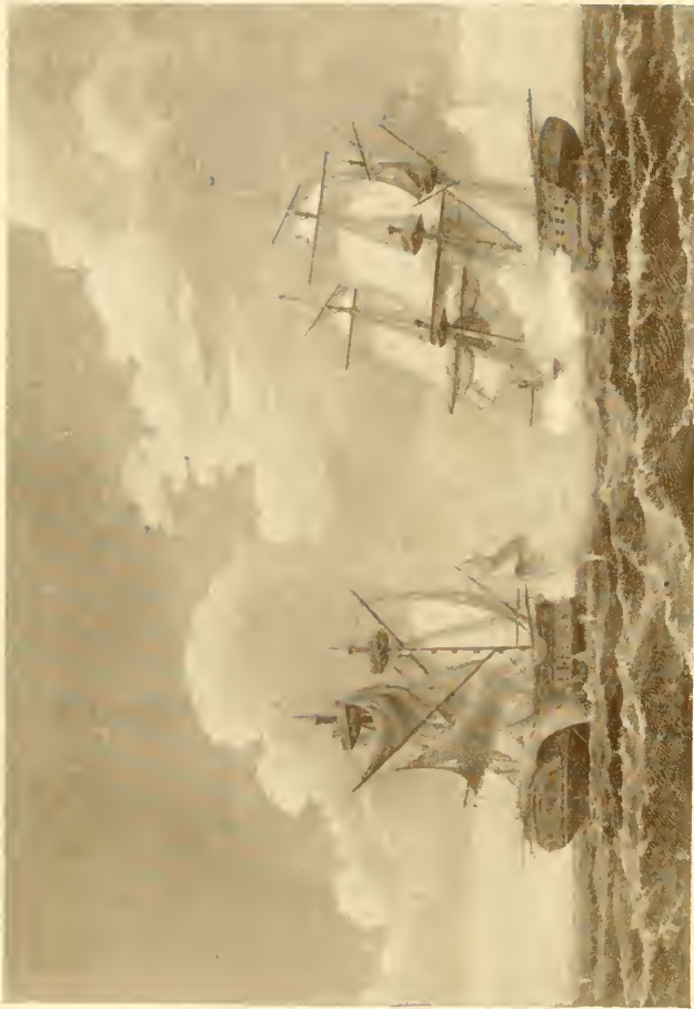
THE UNITED STATES AND THE MACEDONIAN