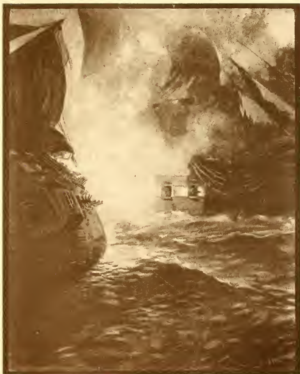
THE "CONSTELLATION" AND THE "VENGEANCE"