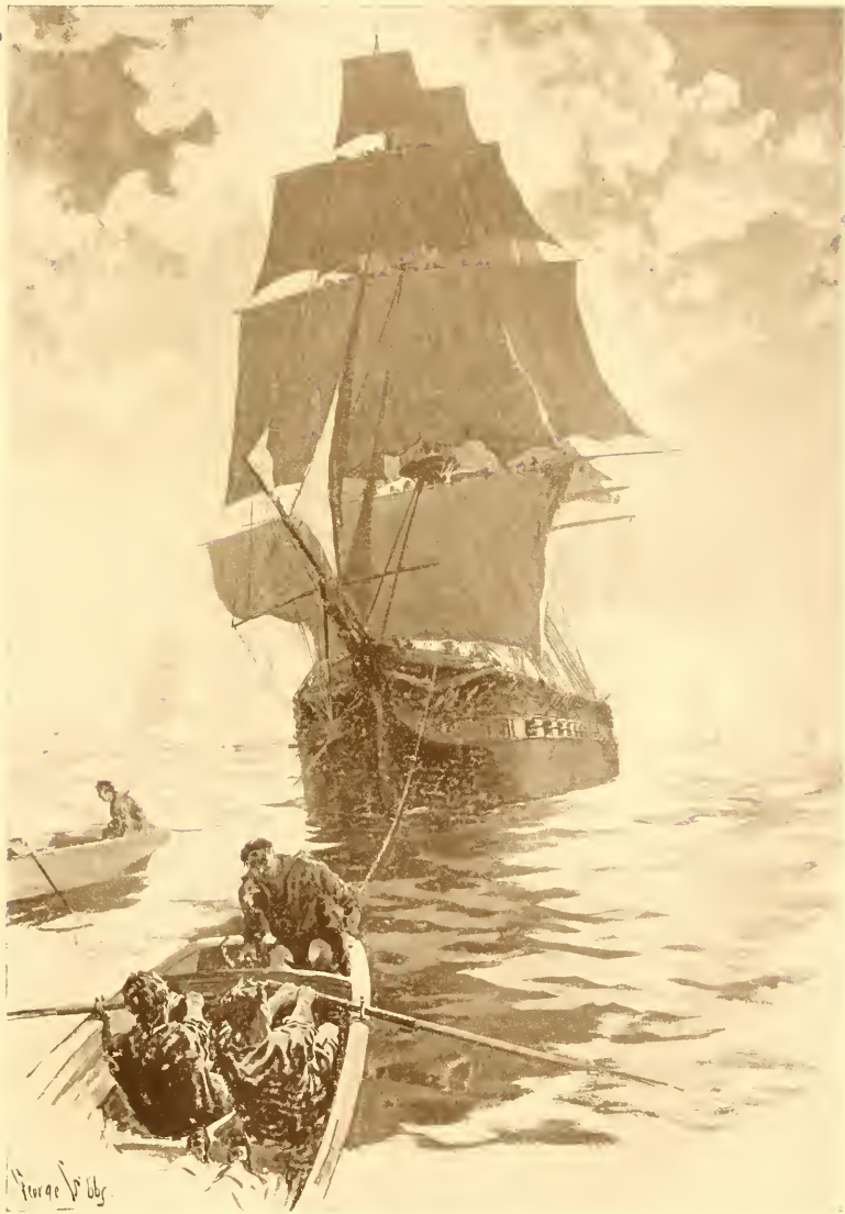
THE ESCAPE OF THE "CONSTITUTION"