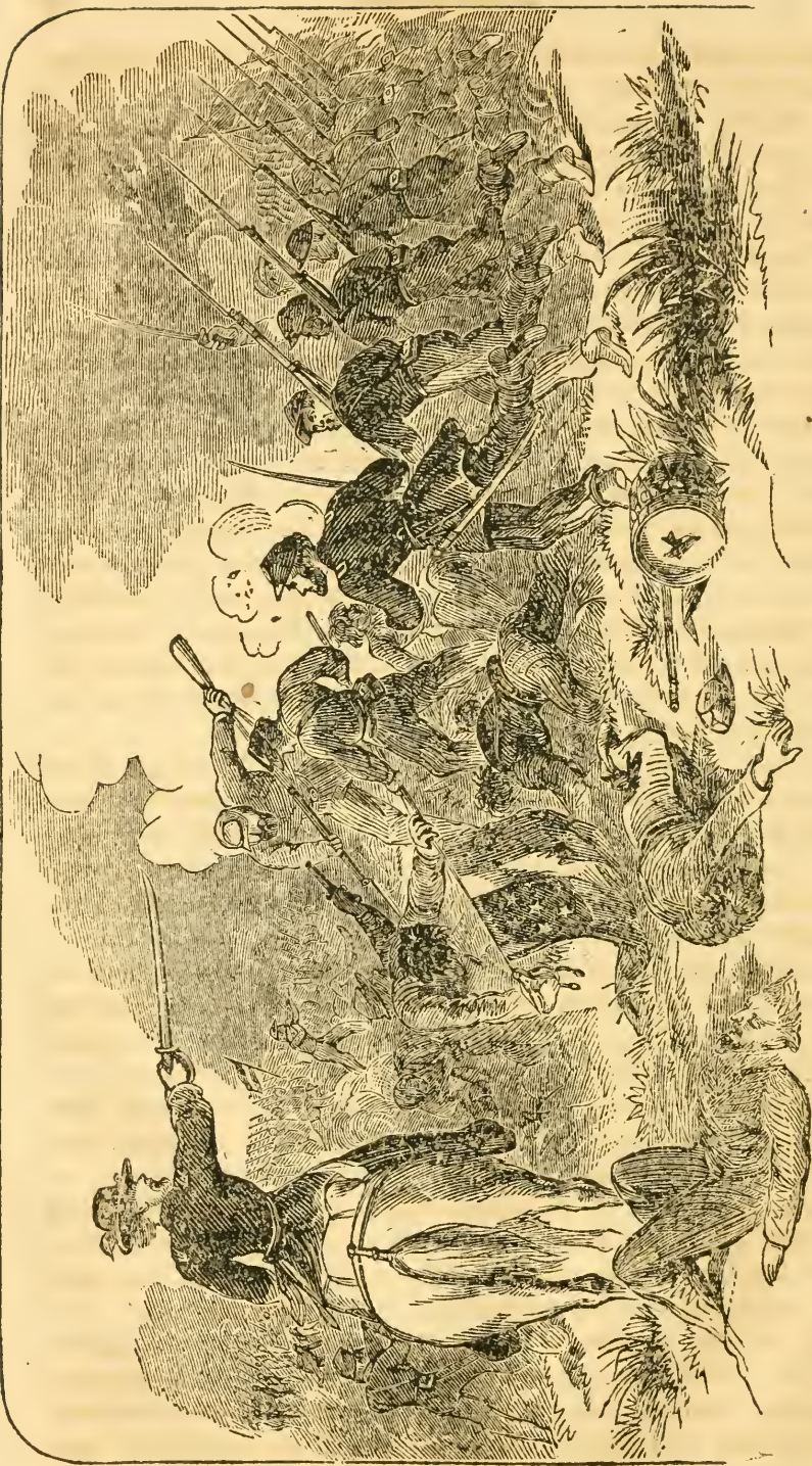
"A moment or so later, and the indomitable Colonel Sullivan actually hurled his gallant regiment against the advancing rebels, drove them back in confusion, and then, capturing their colors, retreated in safety."—See Page 95.