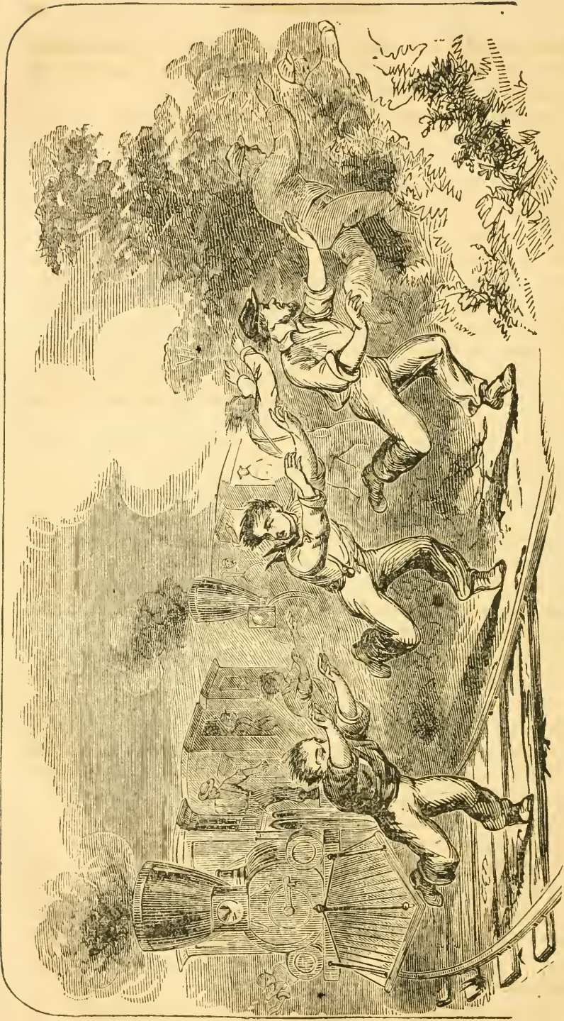
“As the fast-failing locomotive dashed back to meet its pursuers, our fugitives leaped to the ground, and separating into ones and twos, plunged into the forests on either side of the road.”—See Page 26.