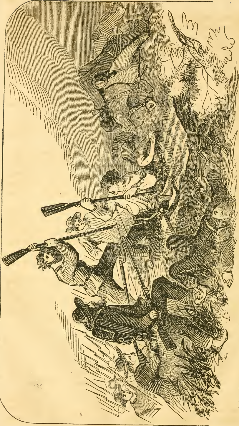
“As a dozen bayonets pierced his body, however, he drove his own weapon, by a tremendous effort, into the ground before him, and thus pinned the sacred banner to the earth.”—See Page 62.