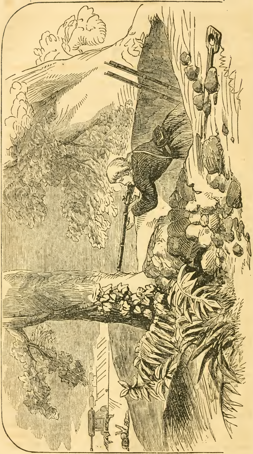
"Suddenly I saw a soldier grasp the lanyard, and in an instant, dropping my racker and morsel of meat, I...