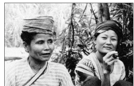
FREE BURMA: 'A slogan, a hope, a certain number of Web pages ...'