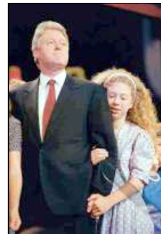
ARCHIVES: Unofficial archives of Presidential materials includes the speech Bill Clinton gave at the 1992 Democratic Convention. Here is a picture of him at the convention with his daughter, Chelsea.

Without Web pages to bounce around on, Linux enthusiasts communicated solely through e-mail lists and