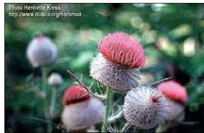
PLANTS: There are links to plant-related sites, including information about herbs and more than 4,000 photographs.

Beyond a learning bent, ibiblio will continue to grow as a digital library run by its contributors armed with