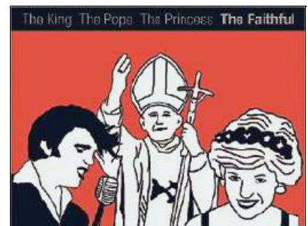
ELVIS LIVES: The Unofficial Elvis site links to a film about Elvis, John Paul II and Princess Diana.