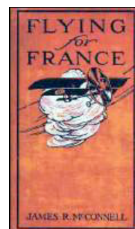
THE SOUTH: Ibiblio has electronic texts of many Southern-themed books, such as this about a World War I aviator from North Carolina.