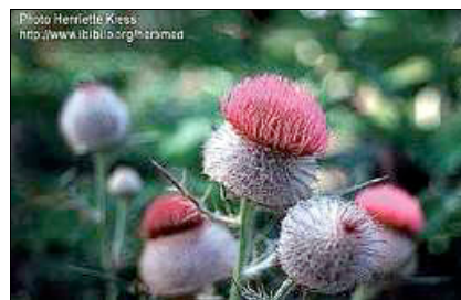
PLANTS: There are links to plant-related sites, including information about herbs and more than 4,000 photographs.

Beyond a learning bent, ibiblio will continue to grow as a digital library run by its contributors armed with