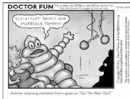
DOCTOR FUN: The longest-running comic on the Web has been on ibiblio since 1993. The strip is popular, but not commercial. Going commercial gets you booted off ibiblio.