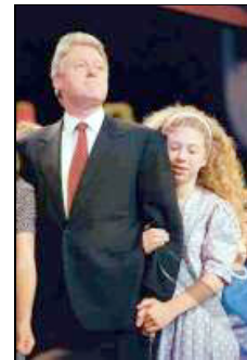
ARCHIVES: Unofficial archives of Presidential materials includes the speech Bill Clinton gave at the 1992 Democratic Convention. Here is a picture of him at the convention with his daughter, Chelsea.

Without Web pages to bounce around on, Linux enthusiasts communicated solely through e-mail lists and