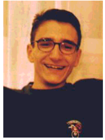
by Reha K. Gerçeker <gerceker/at/itu.edu.tr>

LinuxFocus article number 233 http://linuxfocus.org