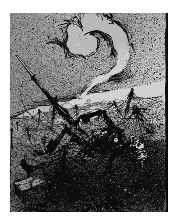
What's The Use?

War is a great ager. Young men grow old quickly here. It can be seen in their faces; they have lost all the irresponsibility of youth. I have met many men who have been here since Mons; they all look weary and worn out by the strain. Now new troops are coming forward and it is hoped that they will be able to send some back for a rest.