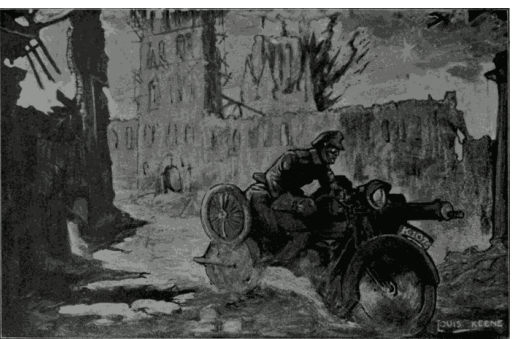
Bringing Up A Motor Machine Gun

Brigadiers have a great aversion to any kind of motor vehicle being driven past their headquarters, owing to the movement and noise, which they believe attracts attention to themselves, and as a rule the sentries posted outside will see that no machines go by. We get up as far as we can, because after we part from our machines, everything must be carried up through the trenches by hand.