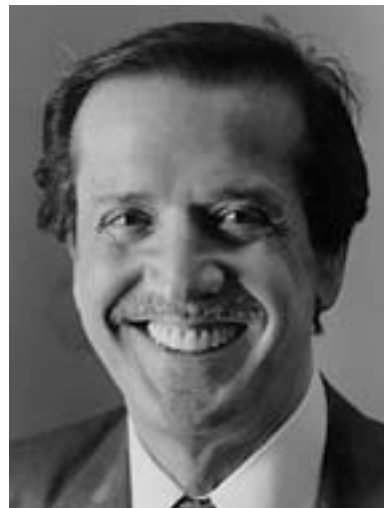
Sonny Bono is dead, but his copyright legislation is not.

That idea became the basis for laws regarding everything from jukeboxes to cable TV. But when the Internet came along the government forgot about balance and decided that property rights trump all. Maybe we ought to stop coddling the Scrooge McDucks and free Steamboat Willie.