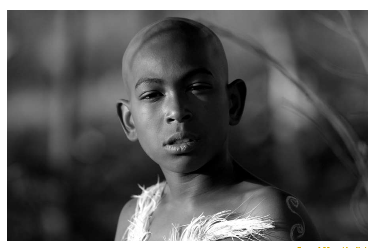
Son of Man (Jezile)