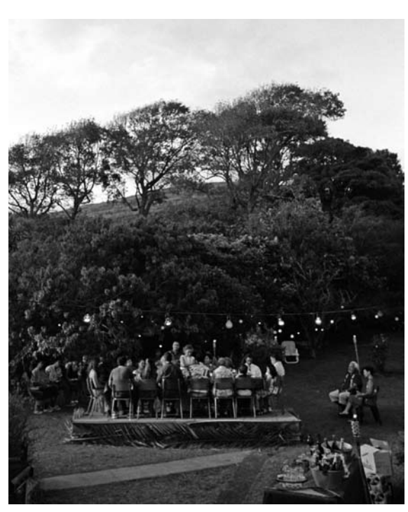
Naming Number Two (No. 2)

The Diaspora Festival of Black and Independent Film is the Stone Center's twice a year series featuring primarily independent film from all corners of the African diaspora. All screenings are free and open to the public. For more information, contact the Stone Center at 962-9001.