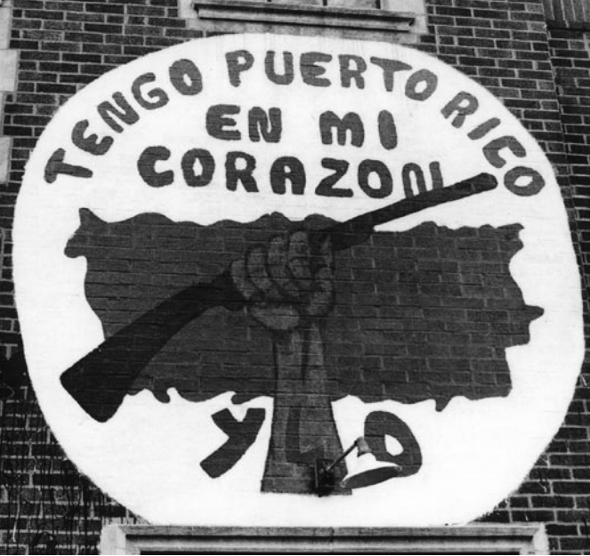
Tengo Puerto Rico en Mi Corazon – YLO Official Logo (1971)