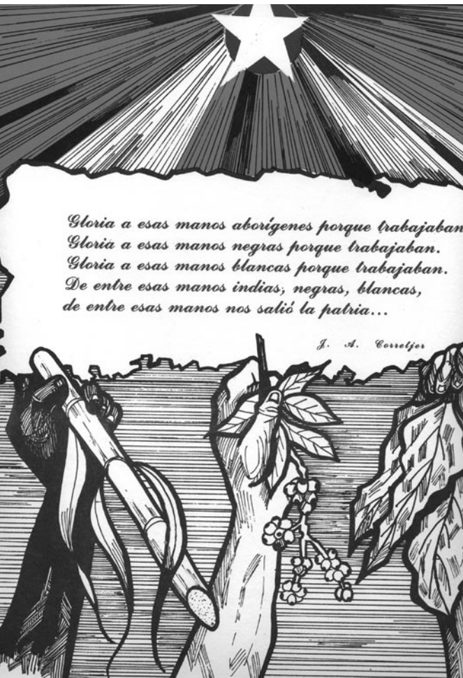
¡Unete al 8º Desfile del Pueblo! (nd) Artist: Unknown Stone Center Collection

the Young Lords made “the People’s Church” a sanctuary for the people – a place for learning and livelihood triumphing over what they viewed as an unresponsive and oppressive institution.