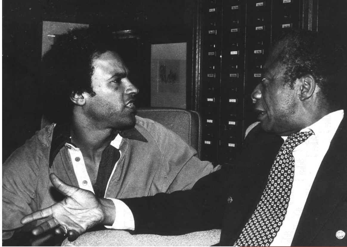
Huey Newton With James Baldwin (1969)

P. Newton decided to close all Black Panther Party chapters outside of Oakland, and ordered party members to relocate to Oakland to support the campaign. This phase concluded with the departure of Bobby Seale, who resigned from the organization in July due to irreconcilable differences with Newton.