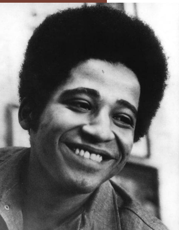
'Soledad Brother' George Jackson (1971)

This deradicalization phase was highlighted by the Bobby Seale–Elaine Brown campaign for political office in Oakland. So important was this shift toward electoral politics that Huey