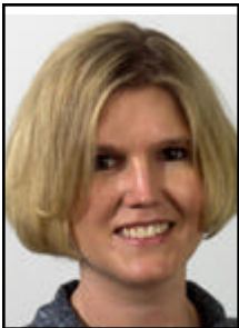
BY KATHRYN PEASE