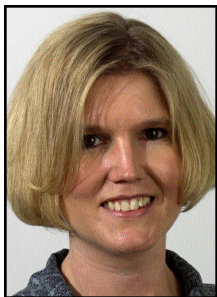
BY KATHRYN PEASE