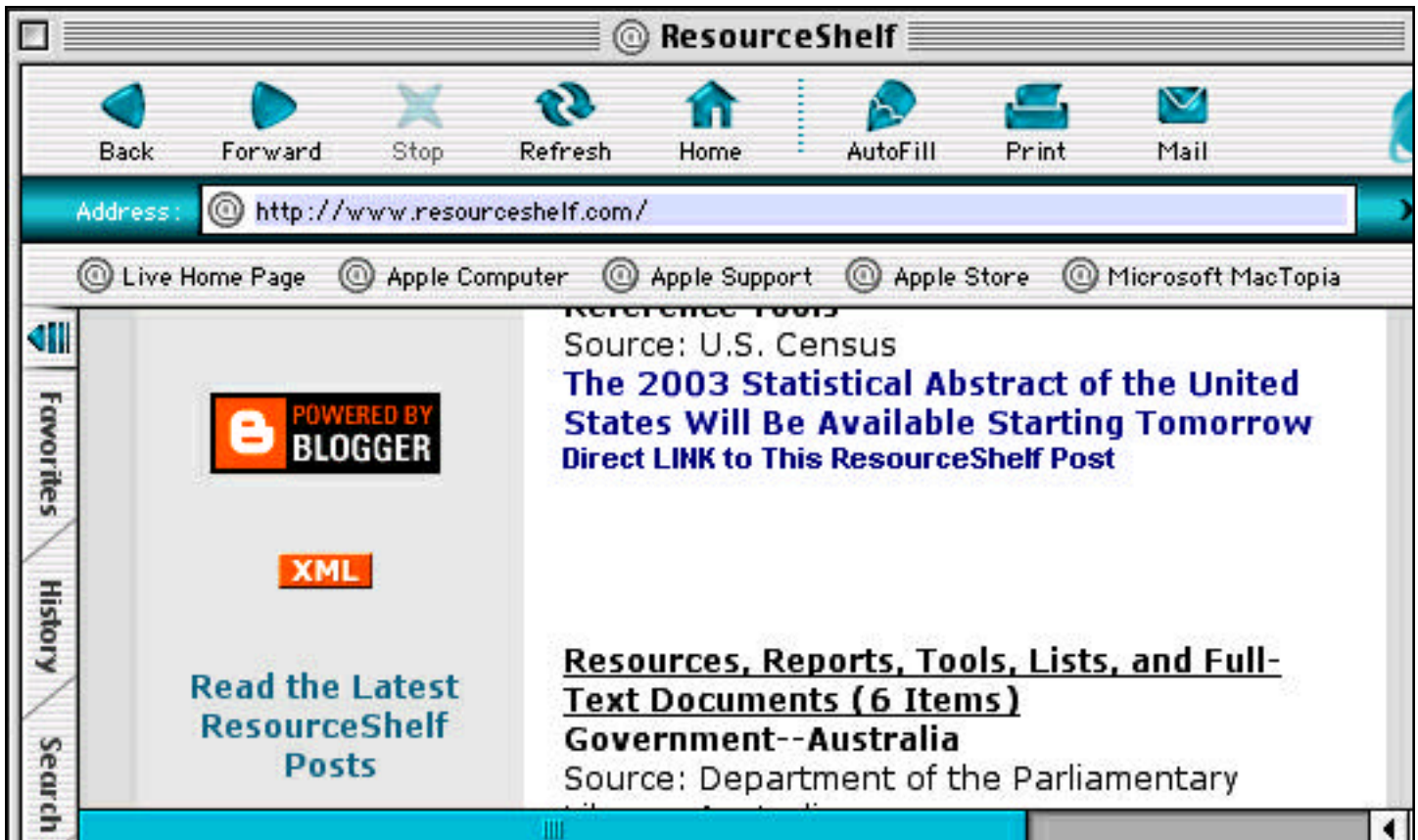
The ResourceShelf site has an orange XML button indicating an RSS feed.