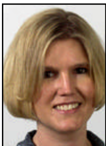
BY KATHRYN PEASE