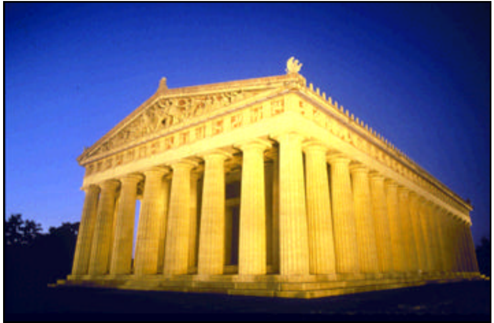
The "Athens of the South" comes complete with a life-size replica of the Greek Parthenon.

There are a number of great honky-tonks in Nashville. The best place to go to experience this type of nightlife is downtown to Tootsie's Orchid Lounge or perhaps you can join a line dance at the Wildhorse Saloon. You may have heard of