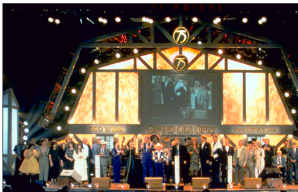
Grand Ole Opry

People hear the word Nashville and immediately think "country music." For over 60 years, Nashville has been developing the identity of "Music City, USA." While Nashville is mainly known for country and gospel music, you can find music at various venues around town to satisfy your tastes, including rock, jazz, R&B, and classical. Almost every night of the week Nashville's clubs and coffee houses host local and nationally known performers, as well as songwriter nights. Nashville locals frequently tell about celebrities who drop in to catch one another's shows (many performing artists make Nashville their home) at places like the Bluebird Café located near Green Hills Mall.