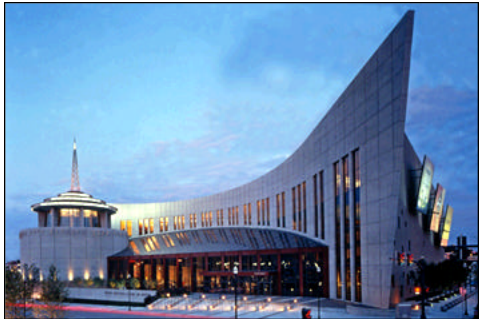
The Country Music Hall of Fame is a "must see" while in Nashville.

Festival ( http://www.bonnaroo.com/ ). Think Woodstock in Tennessee. It is about an hour drive down I-24, southeast of Nashville. Bonnaroo is an outdoor event (bring your camping gear) featuring many bands. Some performers for this year's festival include: Bob Dylan, Dave Mathews, Willie Nelson, and Ani DiFranco. In addition to the live music and camping,