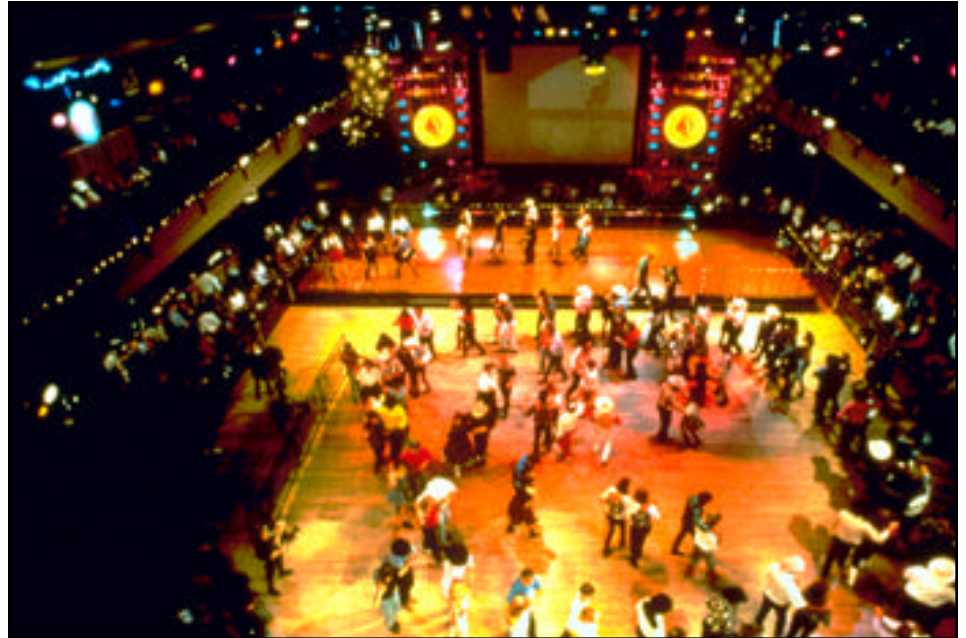
Head for the Wildhorse Saloon for live music and dancing.

Think about sticking around town for a few days after the conference. If you are a music fan, you have two incredible options to choose from: Fan Fair and Bonnaroo. The CMA Music Festival ( http://www.cmafest.com/2004/ ), commonly known as Fan Fair, is June 10 - 13. If you are a country music fan, you should not miss this event. It is held in downtown Nashville and includes daily and nightly concerts and autograph signing sessions. From June 11 - 13 in Manchester, Tennessee, is the 2004 Bonnaroo Music