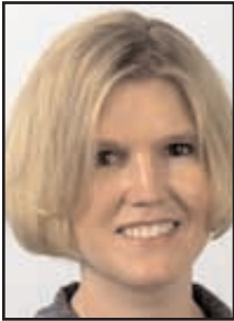
BY KATHRYN PEASE