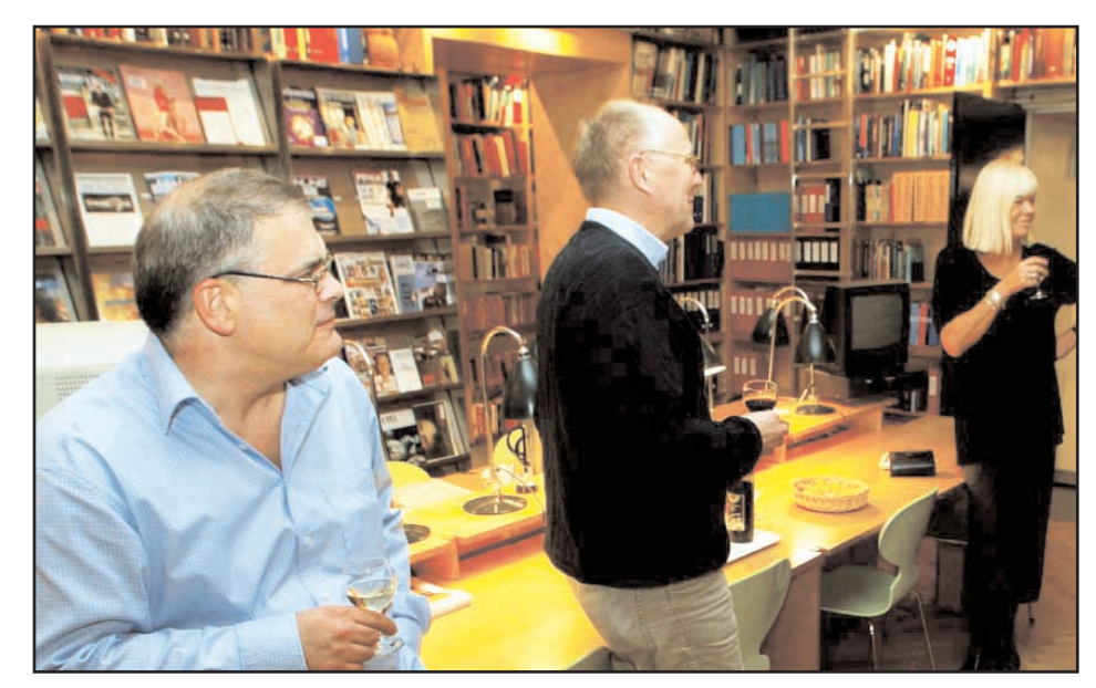
Journalists celebrate the library's tenth anniversary.

n't learn at that time was how to market yourself and your skills, thereby promoting librarians and their competencies."