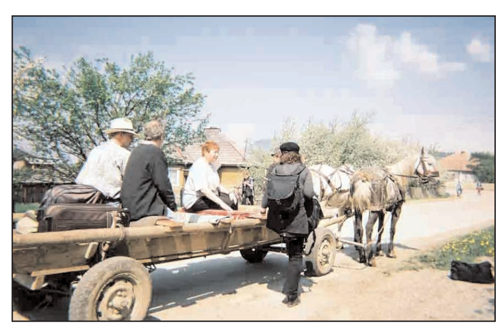
Library research group taking the preferred mode of transportation in Lunca Ilvei.

STRAUB: A few people in the larger cities reported that they were uncertain whether you needed to buy a library card to gain access. According to Western and even Romanian academics, the public library system is free. But everything seems to be for sale in Romania—even test scores to get a student into the university. You can buy