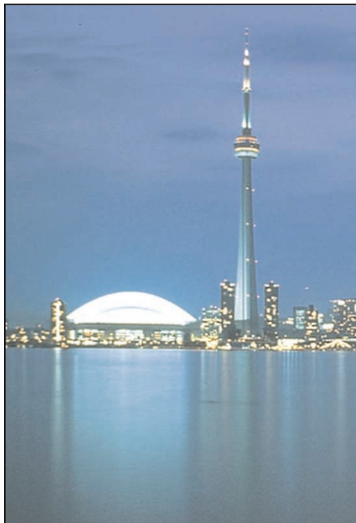
Toronto’s skyline at night, as seen across the harbour from the Toronto Islands.

As the population increased, so did the city’s infrastructure. The University of Toronto opened its doors in 1843. Growth continued in spite of the Great Fires of 1849 and 1904. The new city included an extensive network of roads, railways, canals, shipping and telegraph lines.