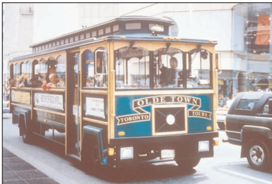
The Olde Town trolley takes visitors on a tour of the city.

❖ Theatres - The area is home to lavish Broadway musicals, traveling road shows, homegrown productions and classical concerts. Theatres include the Pantages, the Royal Alexandra, the Princess of Wales, the Elgin & Winter Garden Theatre