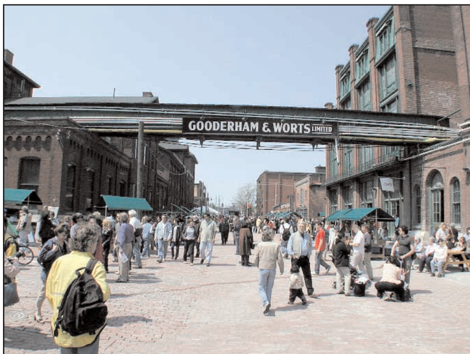
Trinity Street in the heart of the historic Distillery District.

demonstrate the strength of Canadian industry by building a tower taller than any other in the world. In 1995, the CN Tower became a public company and ownership of the Tower was transferred to Canada Lands (CLC) Company, a federal Crown corporation responsible for real estate development. The CN Tower, on the north shore of Lake Ontario, is situated on Front Street, which is located in the heart of the Entertainment District. The CN Tower is easily accessible from Union Station as well as many major streets and highways.