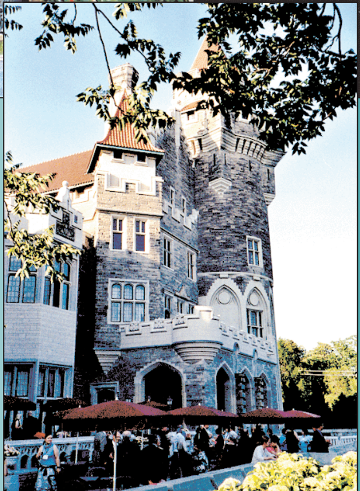
Awards Reception at Casa Loma sponsored by ProQuest