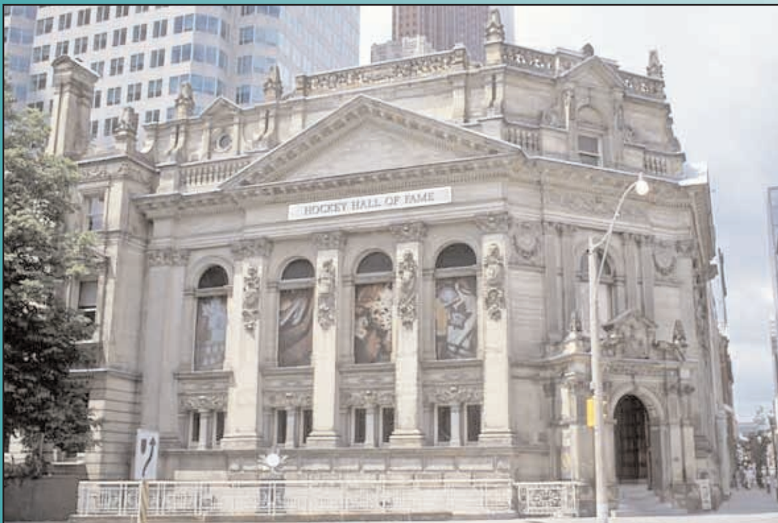
Left: News librarians enjoyed the Hockey Hall of Fame courtesy of LexisNexis