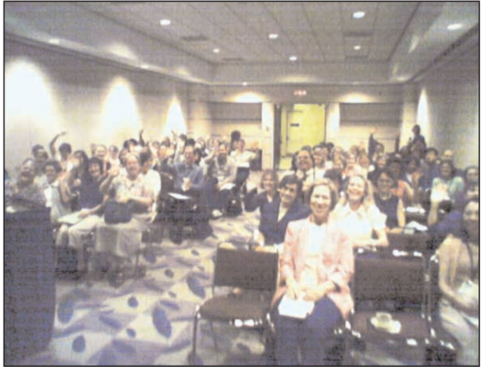
An unexpected crowd for the 7:00 a.m. math class