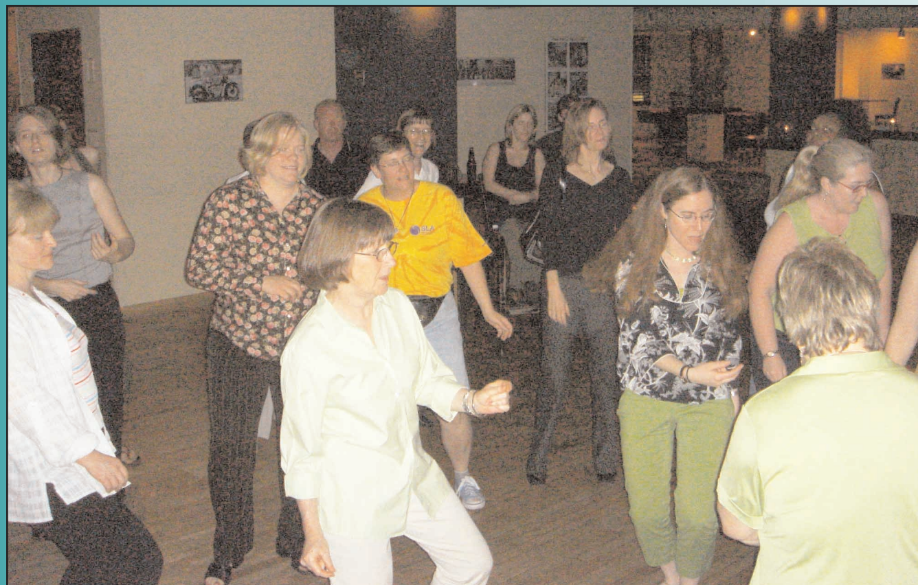
Below: Grooving to the Executive Garage Band