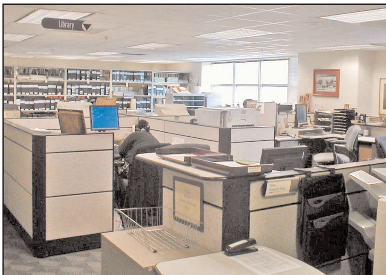
The Baltimore Sun Library

The library is open from 6 a.m. to midnight Monday through Friday and from 9 a.m. to 5:30 p.m. on Sunday, with research assis-