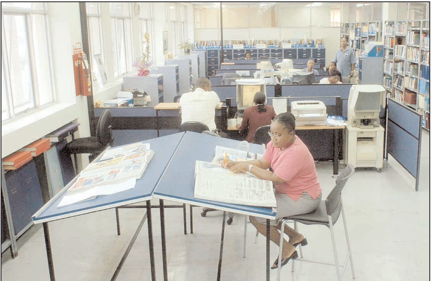
The newly renovated Gleaner Library