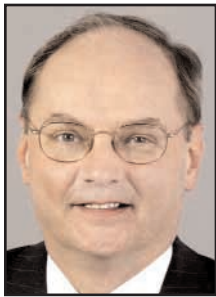
BY JIM HUNTER