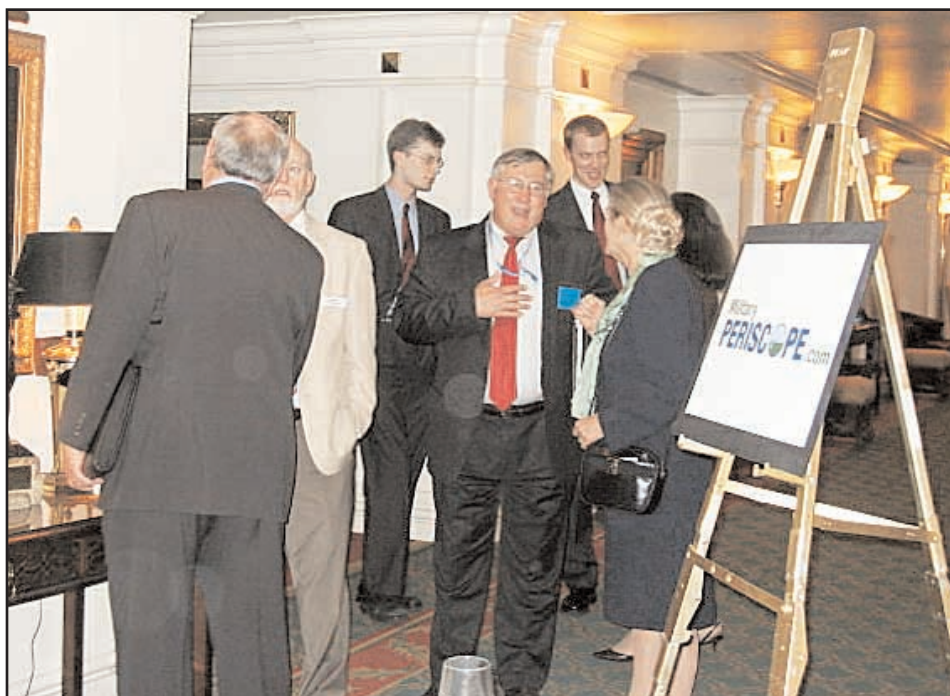
Employees celebrate the twentieth anniversary of the Military Periscope database at the Army and Navy Club, Washington DC, in November 2006

Were it not for author Tom Clancy, the database might never have been created. Flush with revenues after publishing Clancy's blockbuster title, The Hunt for Red October (1984), the United States Naval Institute (USNI) and Information Spectrum Inc. spearheaded the database in 1986 as an alternative to the paper version of researching weapons records. Military Periscope (then called the USNI Military Database) became the first all-electronic, subscription weapons database of global unclassified information that also included