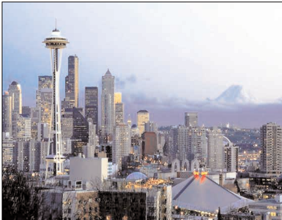
The Seattle skyline.

Seattle Art Museum's new outdoor sculpture park is a free public arts park with monumental sculptures and a glorious view of Puget Sound. Keep walking north to Myrtle Edwards Park, a pedestrian and bike trail that skirts the edge of Puget Sound and affords great views of the water, as well as