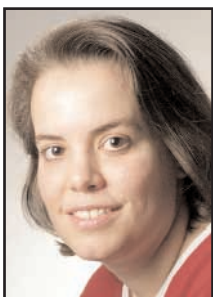
BY AMY DISCH