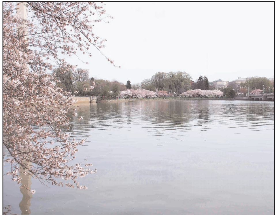
Cherry trees in blossom line Washington, D.C.'s Tidal Basin.

9. From its broad avenues to cobblestone streets, Washington is a great place to explore on foot. Washington Walks ( http://www.washingtonwalks.com/ ) offers over a dozen walking tours around historic