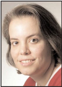
BY AMY DISCH