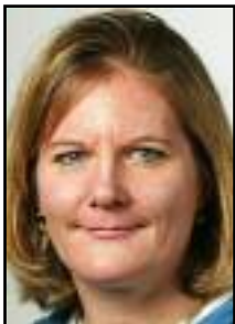
BY LIISA TUOMINEN