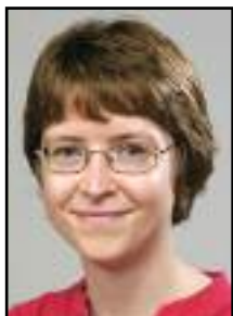
By JULIE DOMEL

January is usually the time when I settle in with a case of ennui. A particularly harsh winter in South Texas has left the landscape black and crispy (as my mother says, “We live down here to avoid that kind of thing.”) and the temperature is more conducive to afghans and lap cats than getting anything done. The hustle and bustle of the holidays is gone, another year is over and I’m left wondering “what now?”