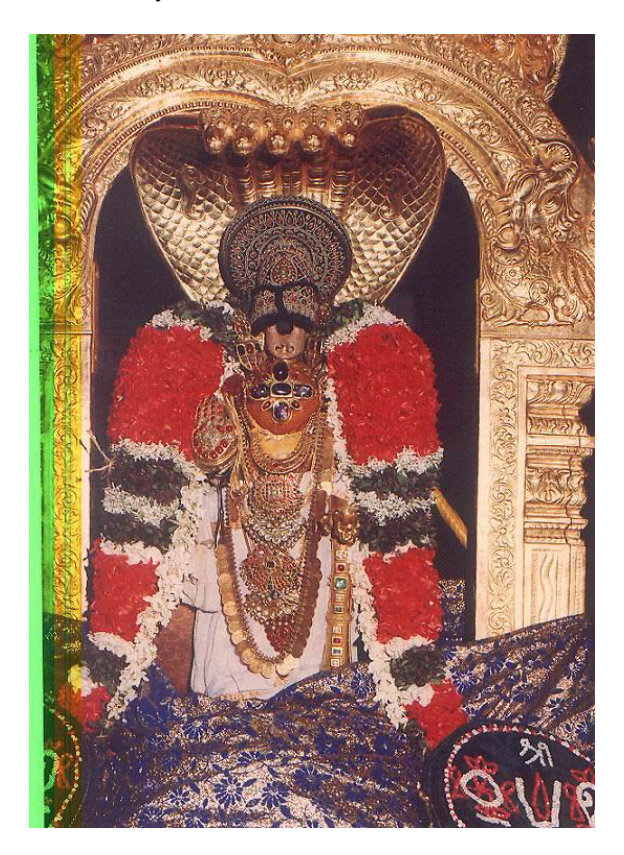
PROCESSION DEITY OF LORD RANGANATHA

Srirangam is located near Trichy (Thiru-chi-ra-palli) – about 10 kilometers from there. There is a railway station at Srirangam, and most of the express trains stop there. It is about 300 kilometers from Chennai. It takes about 6 hours by road from Chennai.