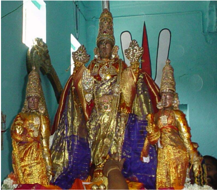
Deva Perumal, Kanchipuram