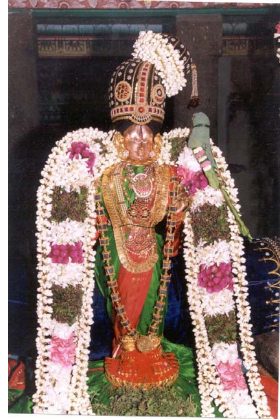
Andal, Sri Villipputhur