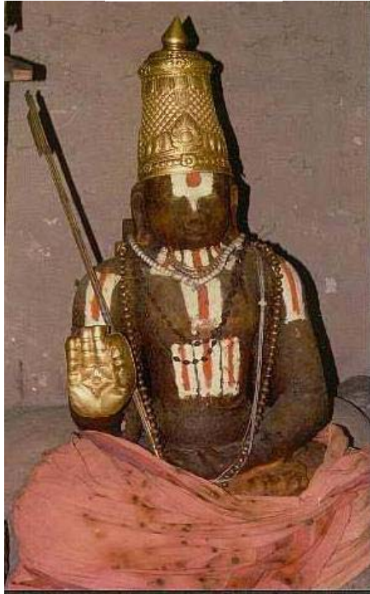
Sri Ramanuja in Sri Rangam

A VEDICS JOURNAL Volume 1 Issue 3: Jul - Sep 2003