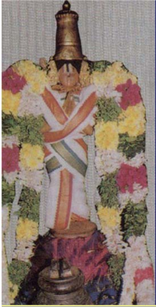
Periazhvar – Sri Villiputhur