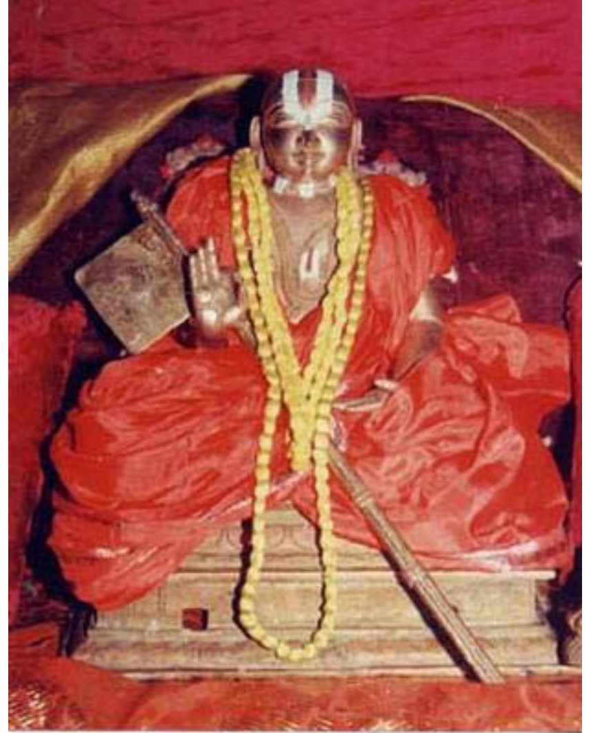
Swami Alavandar

His birth anniversary is in the month of Ani, the star of uttirAdam. It falls on August 10 th this year