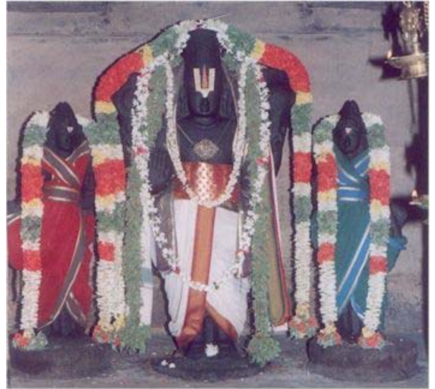
Jagath rakshaka perumal - Thiruk kUdalUr

This is such a miracle for everyone who observed this. For more than 10 years, no one could even go to this temple with a guarantee of worshipping the Lord. Very few people used to go there. All of a sudden, once His devotees showed some interest, the Lord made things happen, and now hundreds of devotees go to this temple everyday.