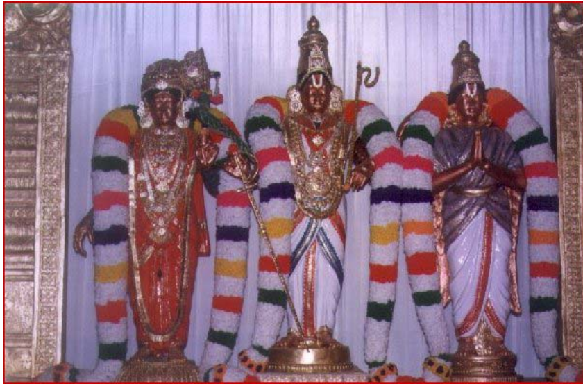
Andal, Rangamannar & Periazhvar

Those not having had exposure or training in recitation of these 4000 hymns can utilize the 10 days as a time of extra meditation on Andal and Her unique mood of bridal love for Sriman Narayana, as well as a time to serve and interact with those devotees who are involved in service to Her and Her Lord.