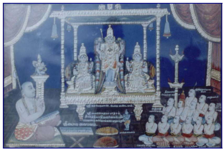
Swami Manavala Mamuni doing idu vyakyanama at Sri Rangam

If there are differences in current day Sri Vaishnava traditions due to modern-day mis-interpretations and extrapolations of an essentially unified view point of the ultimate truth handed down through an exalted lineage of Acharyas, it is simply a reflection of ignorance and/or ego on part of a few refusing to accept the hoary truths that have been passed on. Such efforts seem to be driven by a need to accost and make the ultimate reward accessible only to a chosen few, an unnecessary reorientation of the truth that tends to more undermine the true spirit of our philosophy than assist in extending its comprehension. That such efforts fail to reflect the one message of universality of divinity and compassion of Swami Ramanuja is something to take to heart; that such efforts exist and continue their attempts at distortion, underscores the need for all of us to simply allow the omnipresent Divinity to work through us, to bring to light the true essence of Ramanuja darshanam, a philosophy for all of man kind, for all times.