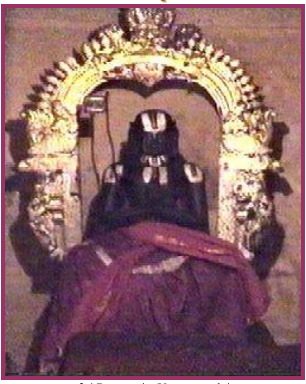
Sri Ramanuja, Vanamamalai

A VEDICS JOURNAL Volume 1 Issue 4: Oct - Dec 2003