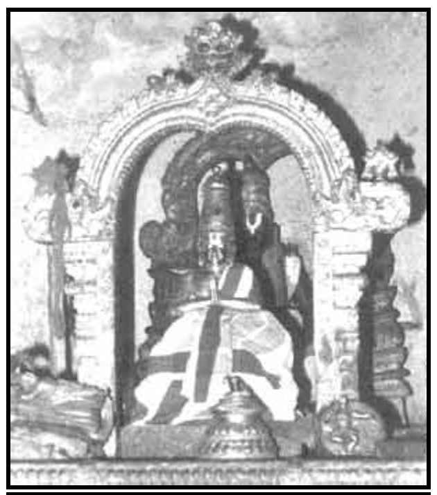
Sri Pillai Lokacharyar

(If it be said that it is necessary to remove both of these - the defects and lack of merit-, then both become the Lord's).