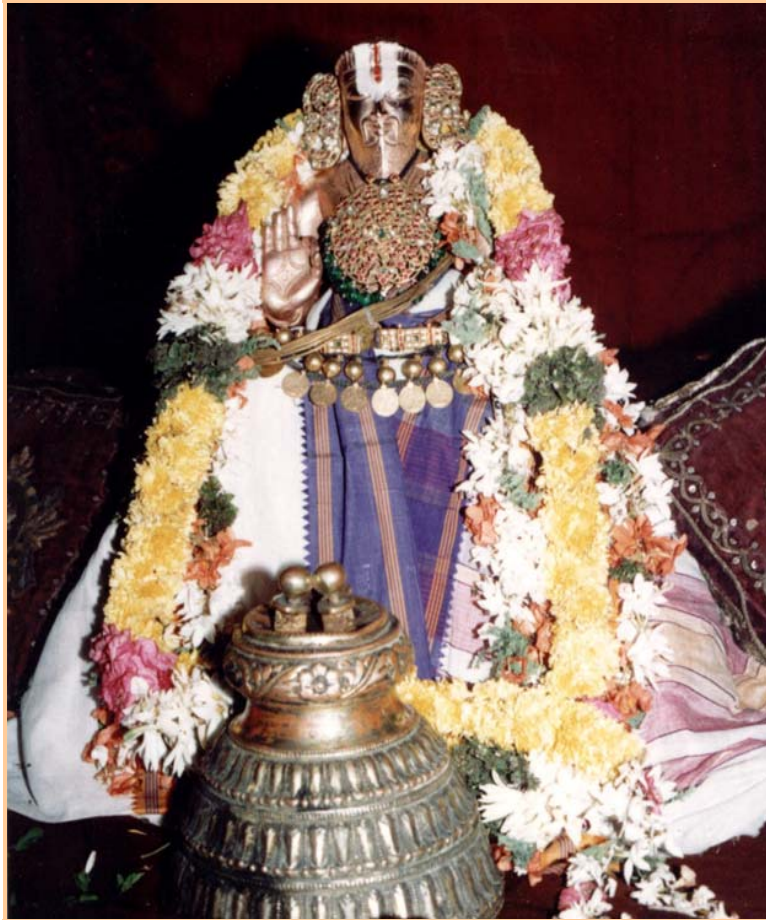
Kurathazhvan, Sri Rangam

It is impossible to capture in words the greatness of Sri Kurathazhvan. Hence, I end this essay with a note that if only every human being had the good fortune of knowing, coming in contact with verily the greatest of our preceptors, our lives would be altered, uplifted, for the better, and proximity to Sriman Narayana would then be simply a matter of course, available with no effort whatsoever on our parts.