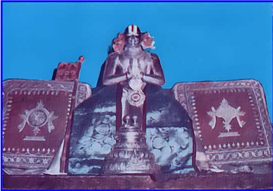
Swami EmbAr

Swami Embar’s birthplace, Maduramangalam, is near Kanchipuram and Sri Perumbudur, and there is a beautiful temple there that one can go to even today. Svami Embar’s birthday falls on the start of Punarvasu, in the month of thai.