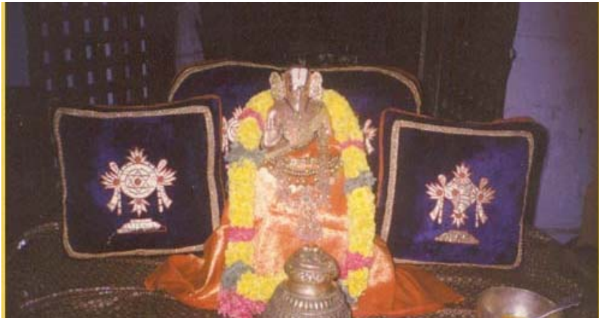
Swami kUrathAzhvAn at Kooram

Thus, swami kUrathAzhvAn continues explaining the greatness of Sri Ranganachiyar. In fifth sloka (kshodeeyanapi...) he shows his "naichchiam" (i.e, even though a person of exalted intellect and qualities, considering oneself as very inferior). With his naichyaanusandaanam, he proclaims the divinity of pirAttiyar. There, he states "Even though I am full of all bad qualities and am praising You, Your fame will not vanish just as the fame of Ganges will not vanish because a dog tastes the Ganges water. Instead, it quenches the thirst of the dog, as does Your grace falling upon me." In the last shLOka , swami kUrathAzhvAn prays to Sri Ranganachiyar to shower Her grace on him, if only for a brief moment, so that he may forever be redeemed.