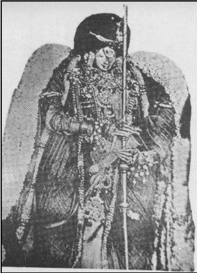
Sundarrajar, kallazhagar temple

Location: Azhagar Koil, 21 km north of Madurai, is placed atop a picturesque wooded hill called Azhagar malai/hill and has many beautiful sculptures of Vishnu / Sriman Narayana. Madurai is a major city, whose Airport is connected with Chennai, Bangalore and Tiruchirapalli. It is also a major train junction connected with important cities of Tamilnadu and is also well connected by road.