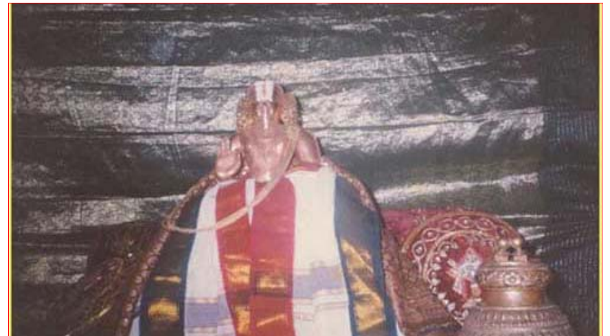
Swami Kurathazhvan, Kooram

The festivals listed are based on the calendar that is followed in Thiruvallikkeni (Triplicane, Tamil Nadu). Festivals are shown based on the time in India, and as a result, may not necessarily represent the date the festival falls in the US and other countries. Please contact your Acharya or a temple priest to determine the exact date and time of a specific festival.