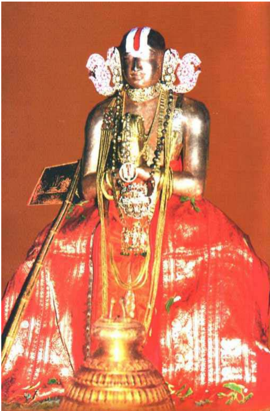
Swami Ramanuja, SrI perumbudUr