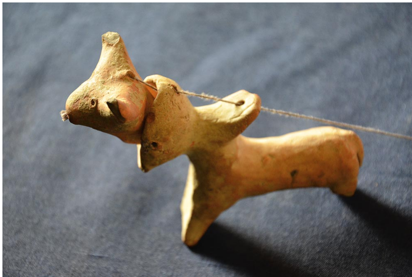
A Harappan toy bull figurine