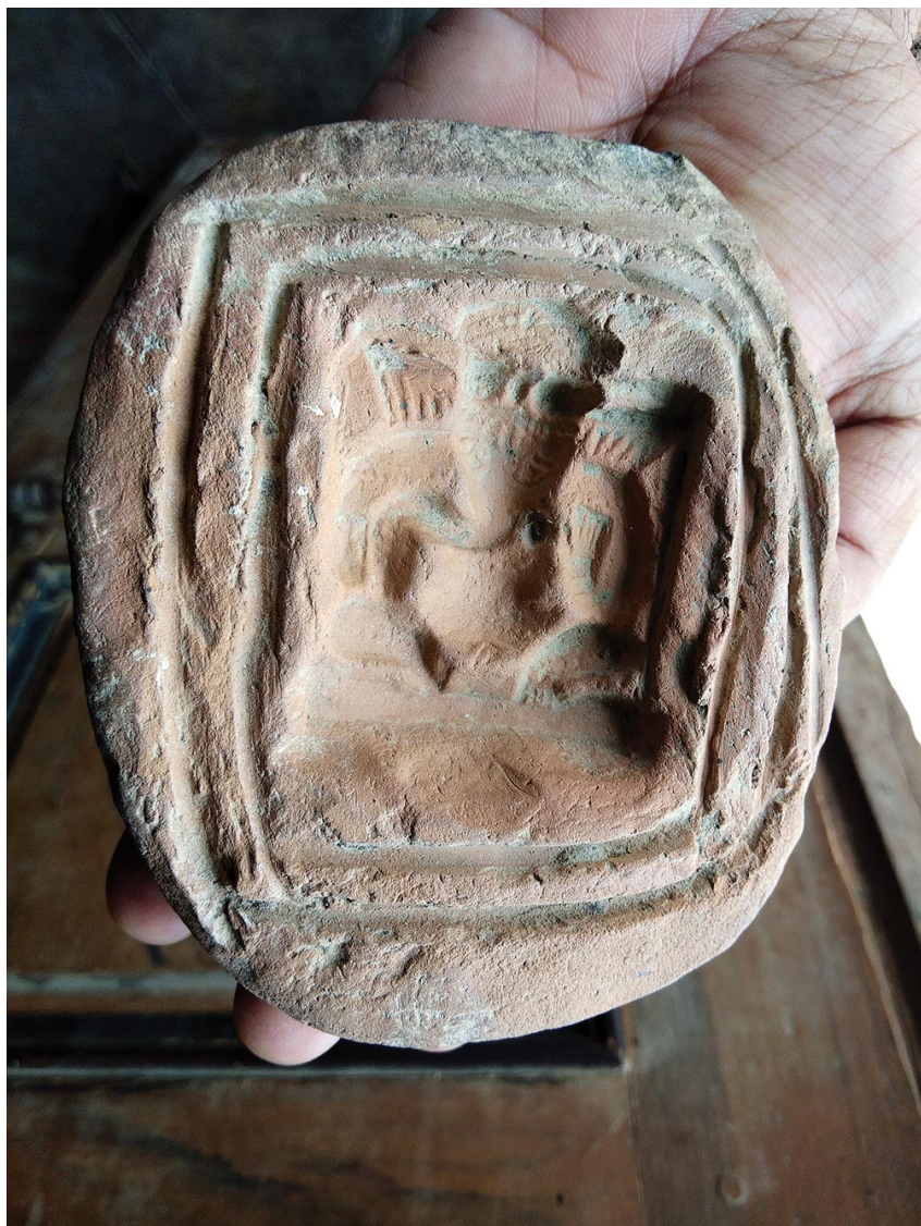
A Kushan era seal found in Rakhigarhi