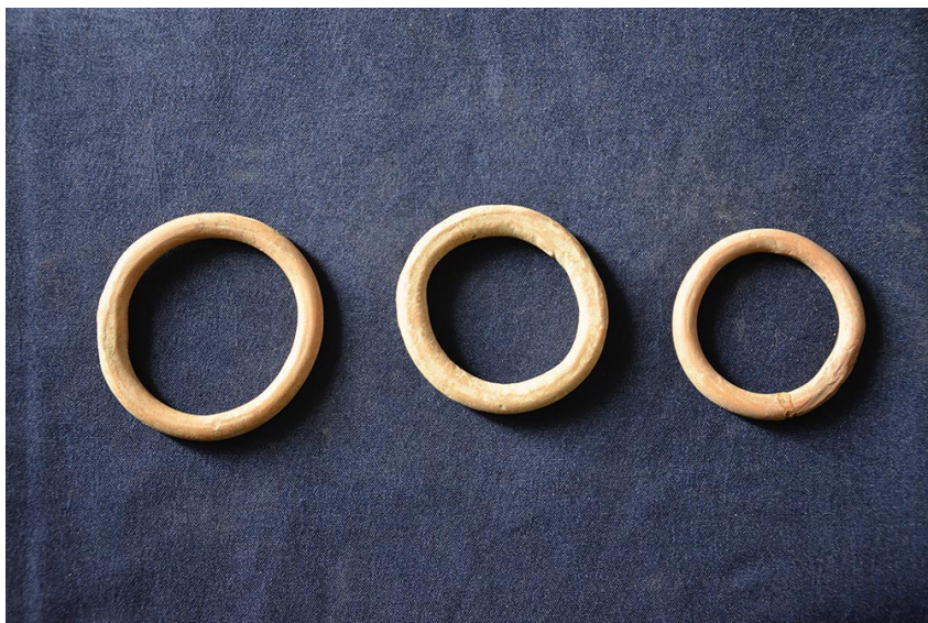
Harappan terracotta bangles

But couldn’t farming have evolved in India—or elsewhere outside the Fertile Crescent—independently? Perhaps. And goats domesticated? Again, yes...even the last big study on Indian goats suggests a story more complex than it happening at Zagros and then spiralling out. But the present study accepts that model: essentially, that the story of ‘civilisation’ began in the Fertile Crescent and spread east. “The first mixing happened around 6000-5000 BC. As the Neolithic (period) started, the Northwest Indian mixed significantly with Iranian farmers,” says Rai.