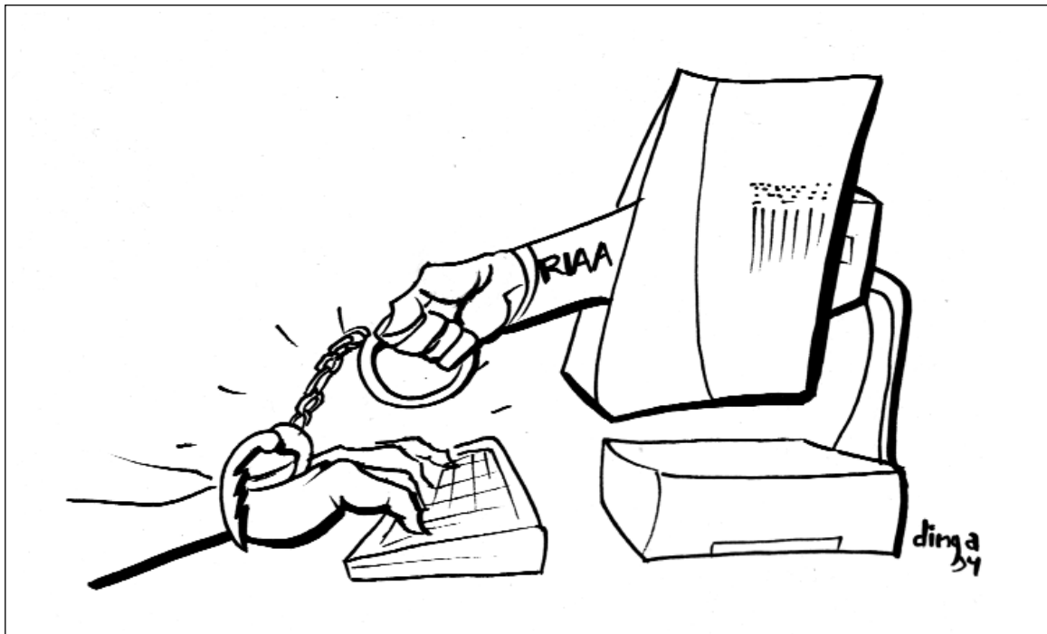
ILLUSTRATION BY DUSTIN INGALLS